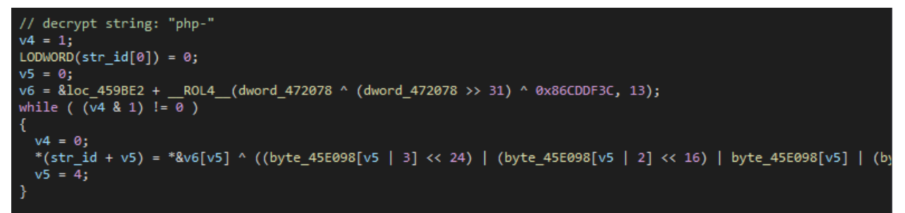
Figure 3 – Example of the decryption of the string "php-".

The second encryption method is tedious and is spliced in-line throughout the program repeatedly at compile time. This generates a complex string decryption algorithm throughout the sample.