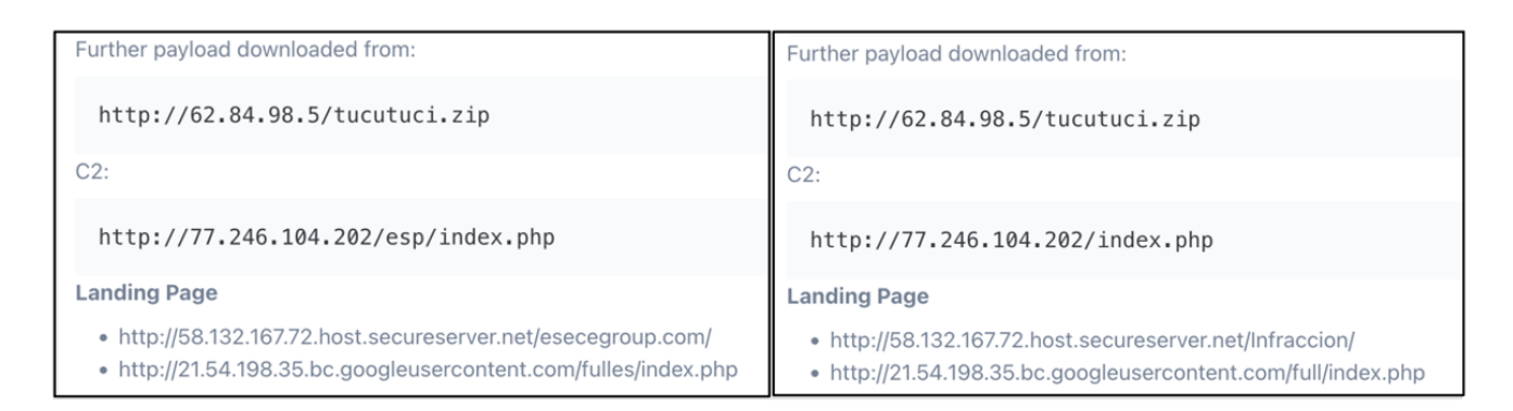
Figure 1. Common C2 and payload download for both campaigns.

Previously, bank customers targeted by Grandoreiro overlays have been in Brazil and Mexico, but recent Grandoreiro campaigns show that this capability has been expanded to banks in Spain as well. Two campaigns attributed to TA2725 spanning from 24 through 29 August 2023 shared common infrastructure and payload while targeting both Mexico and Spain simultaneously. This development means that the Grandoreiro bank credential stealing overlays now include banks in both Spain and Mexico in the same version so that the threat actors can target victims in multiple geographic regions without modification of the malware.