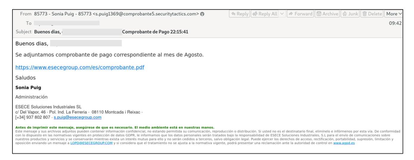
Figure 2. Example of TA2725 targeting of victims in Spain in August and September by spoofing ÉSECÈ Group, a Spanish manufacturing company.

Threat actors from the Americas have previously targeted organizations in Spain but have typically used more generic malware or phishing campaigns that were unique to Spain. In this case, the threat actors have expanded this version of Grandoreiro that had previously only targeted the Americas to include other parts of the world.