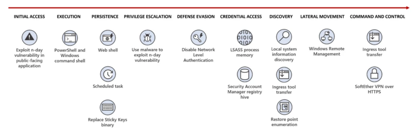
Figure 1. Flax Typhoon attack chain

and finally collect credentials from compromised systems. Flax Typhoon further uses this VPN access to scan for vulnerabilities on targeted systems and organizations from the compromised systems.