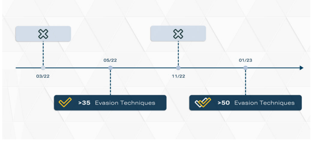
Figure 12: Rough timeline of changes for the evasion techniques