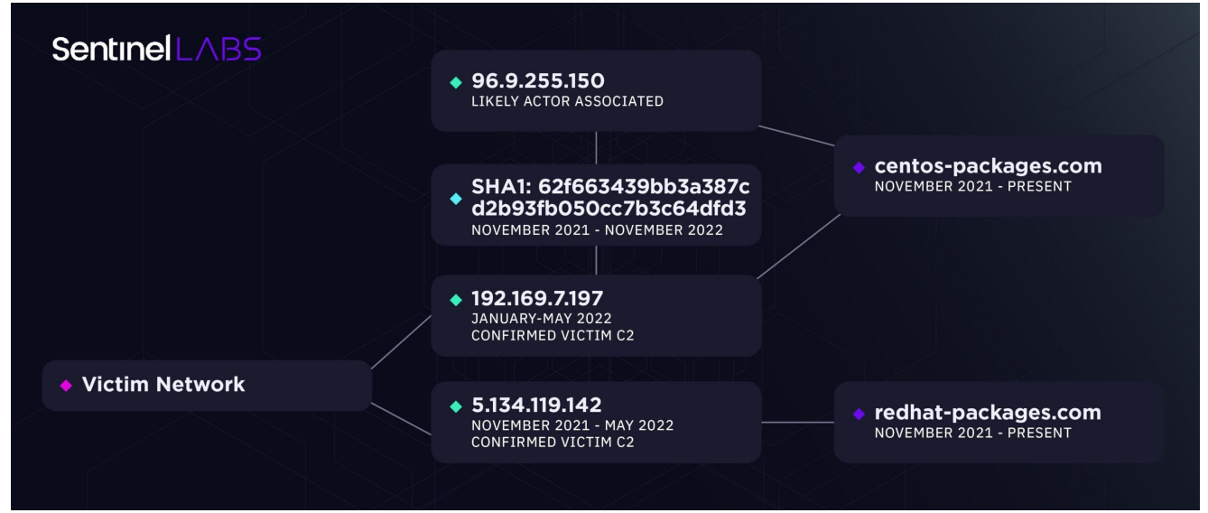
Infrastructure and Timeline

Email between NPO Mash Employees sharing beaconing process details This set of malicious infrastructure was served via CrownCloud (Australia) and OhzCloud (Spain) VPS hosting providers. During the intrusion, the two domains centospackages[.]com and redhat-packages[.]com were resolving to those C2 IP addresses. Our assessment is that this particular cluster of infrastructure became active in November 2021, and was immediately paused the same day of NPO Mashinostroyeniya's intrusion discovery in May 2022. This finding may indicate the intrusion was high priority and closely monitored by the operators.