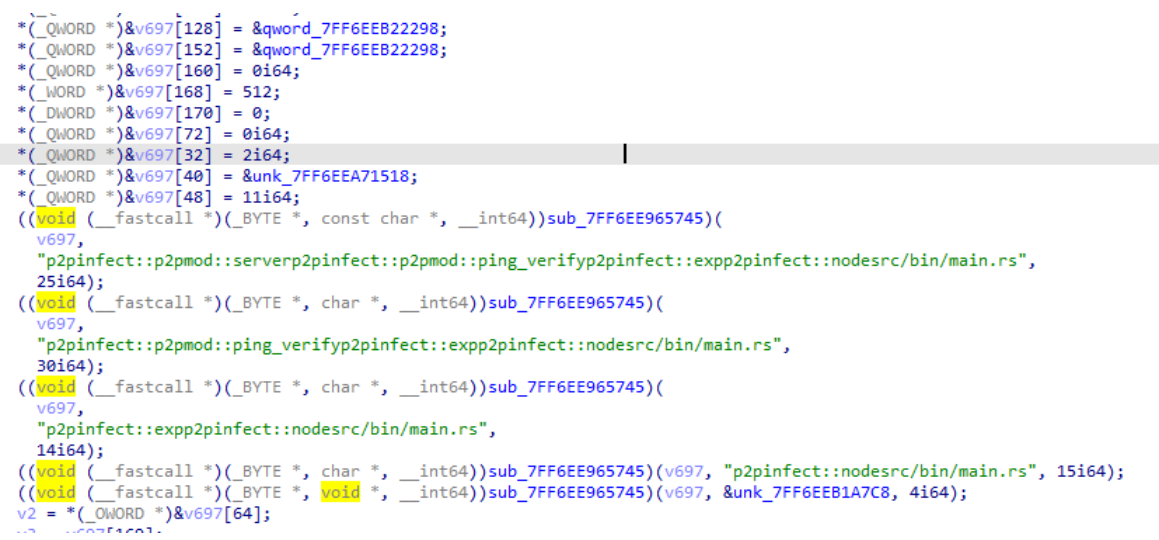
Figure 9. Analysis pulled from the core Windows P2PInfect sample.

We also identified a PowerShell script designed to establish and maintain communication between the compromised host and the P2P network. The PowerShell script leveraged the encode command to obfuscate the communication initiation (see Figure 10).