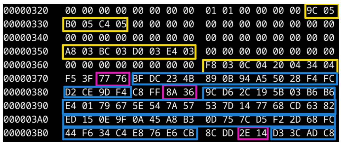
Figure 6. Second part of the encrypted configuration (truncated)

We detail the simplified structure here: