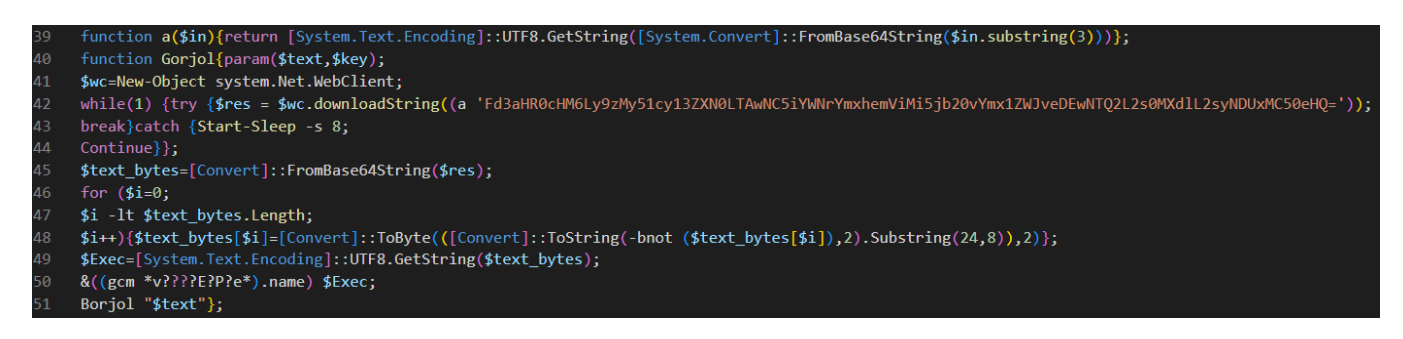
Figure 2. Initial decode, deobfuscate, and download functions used by POWERSTAR's first-stage script, cettj34c.txt

Various unreferenced variables containing encrypted code are present in this script alongside an unused decryption key. This script also contains a small amount of code responsible for decoding a second Backblaze B2 URL, requesting its contents, and then decoding and executing the resulting PowerShell script within the same PowerShell instance as the original script (Figure 2).