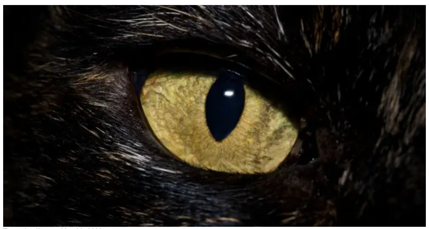
<u>Threat Intelligence</u> May 30, 2023 By <u>IBM Security X-Force Team</u> 9 min read

securityintelligence.com/posts/blackcat-ransomware-levels-up-stealth-speed-exfiltration/