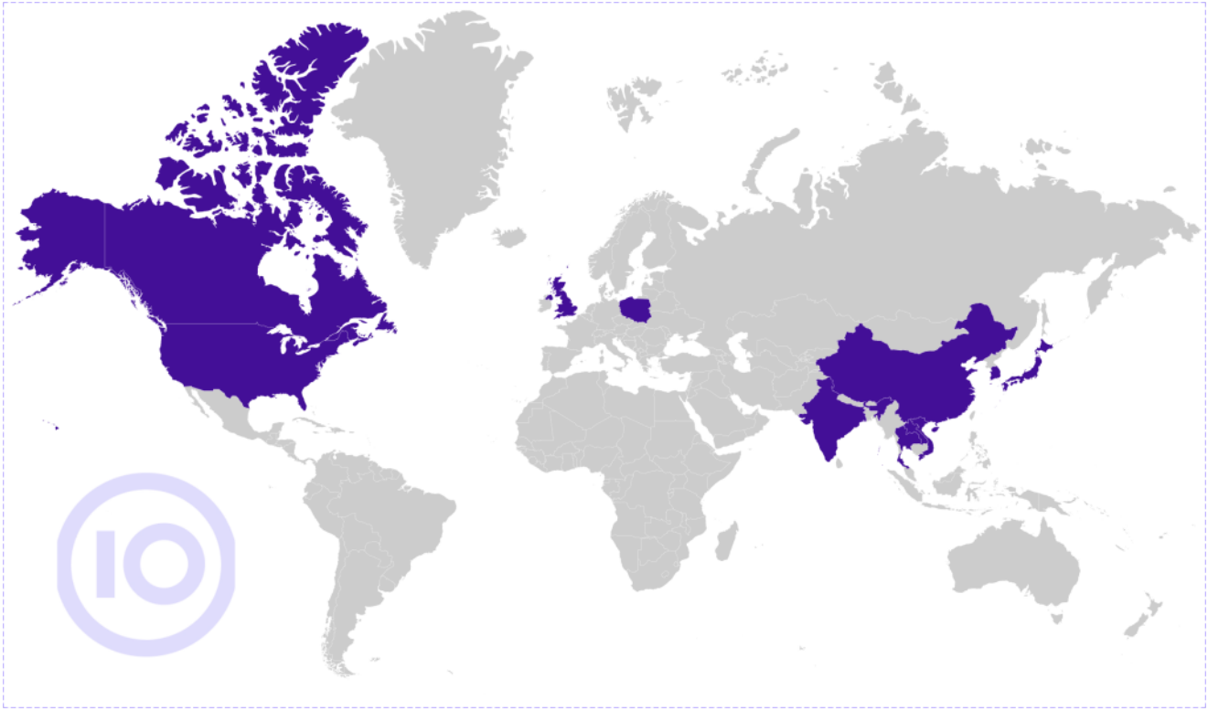
Figure 7. Bluenoroff targets since September 2022

Of note, we also observed that the group may use temporary C2 servers , when testing new techniques , that they then discard rapidly. For instance, in November 2022, Bluenoroff temporarily used a server to transition to using MSI and CAB files (149.28.247[.]34). Similarly, the intrusion set sporadically used a specific server when experimenting with chm (Windows Helper) files (172.86.122[.]181) in December 2022.