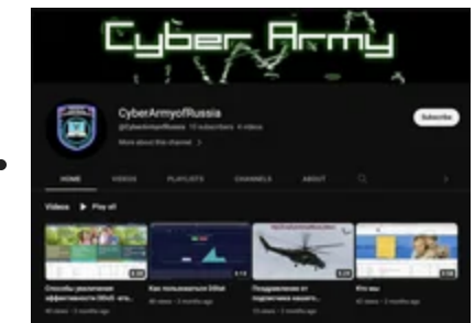
CyberArmyofRussia YouTube channel

Active in the IO space, FROZENBARENTS actors create online personas to create and disseminate news content as well as leak stolen data. These actors promote narratives that are pro-Russia, and against Ukraine, NATO and the West. One persona, which TAG assesses is created and controlled by FROZENBARENTS actors, is 'CyberArmyofRussia' or 'CyberArmyofRussia_Reborn', which has a presence on Telegram, Instagram and YouTube. Both the YouTube channel, terminated upon identification, and Instagram account received minimal engagement with a negligible number of subscribers or followers.