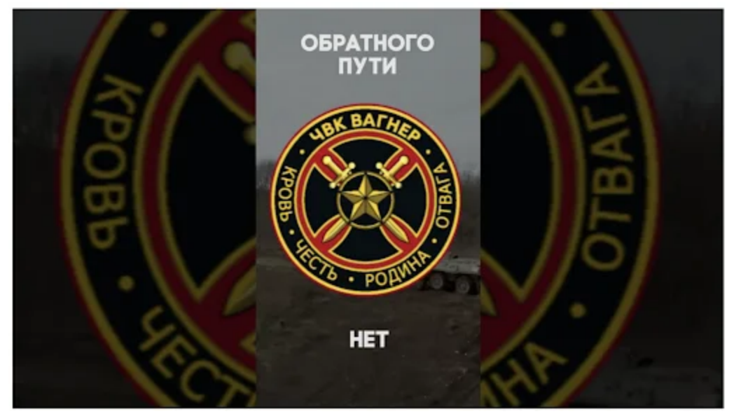
Screenshot from a YouTube short supporting the Wagner Group