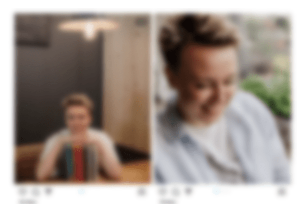
Figure 3. Photos stolen from Instagram to create the @SaShokouhi Twitter persona. Secureworks blurred the images for privacy purposes.

CTU™ researchers discovered that the individual in these photos is not Sara Shokouhi. The image belongs to a psychologist and tarot card reader based in Russia. The threat group responsible for the fake Sara Shokouhi persona stole these images from an Instagram account (see Figure 3) and used them as the basis for the SaShokouhi Twitter account and a corresponding Instagram account (@sarashokouhii). The fake Instagram profile claims Shokouhi was studying for or holds a "PhD in Middle East Polotics [sic]".