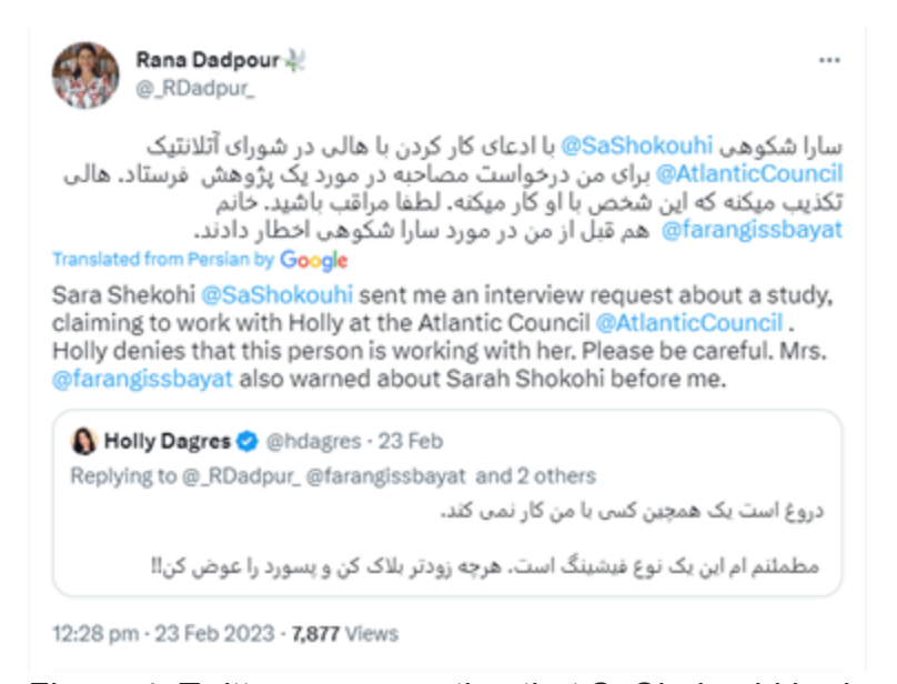
Figure 4. Twitter user reporting that SaShokouhi had contacted them.

It is common for COBALT ILLUSION to interact with its targets multiple times over different messaging platforms. The threat actors first send benign links and documents to build rapport. They then send a malicious link or document to phish credentials for systems that COBALT ILLUSION seeks to access. These systems include online email services, social media services, and other systems used by the target.