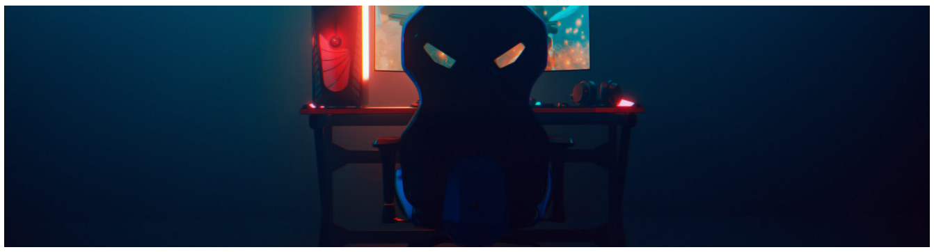
by Jan VojtěšekFebruary 8, 202315 min read

When we think about <u>V8</u> exploits, the first things that come to mind are probably related to sophisticated browser zero-day exploit chains. While the browser may be the most interesting target for V8 exploits, we shouldn't forget that this open-source JavaScript engine is also embedded into countless projects other than the browser. And where a JavaScript engine is used across a security boundary to execute potentially untrusted code, security issues may arise.