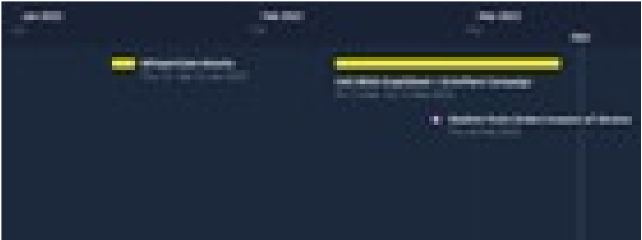
Timeline Demonstrating Known UAC-0056 Activity