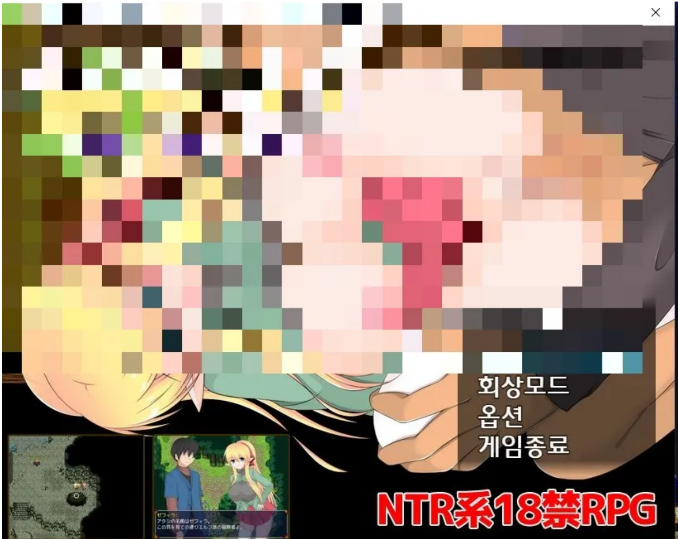
Figure 5. Actual game program run by malware

Once the process above is complete, the “Game_Open.exe” file becomes hidden. After hidden, users would run “Game.exe” which is a copy of game program launcher. Note that “PN” file that was changed to “scall.exe” and executed is malware. It first moves “srt” file existing in the same path to C:\Program Files\EdmGen.exe.