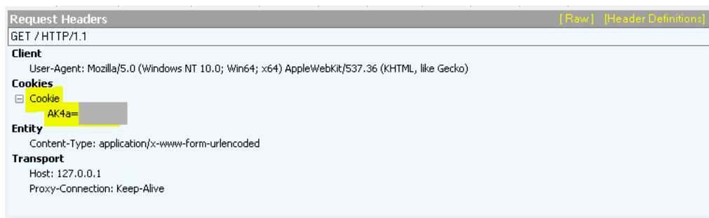
Figure 1: Encoded request from the controller to the victim machine

The gac.exe binary installs ScriptModule.dll into the Global Assembly Cache before using AppCmd.exe to install it as an IIS module. AppCmd.exe is a command line tool included in IIS 7+ installations used for server management. This module hooks into the BeginRequest IIS http event and looks for custom commands and arguments being passed via the Cookies field of the HTTP header.