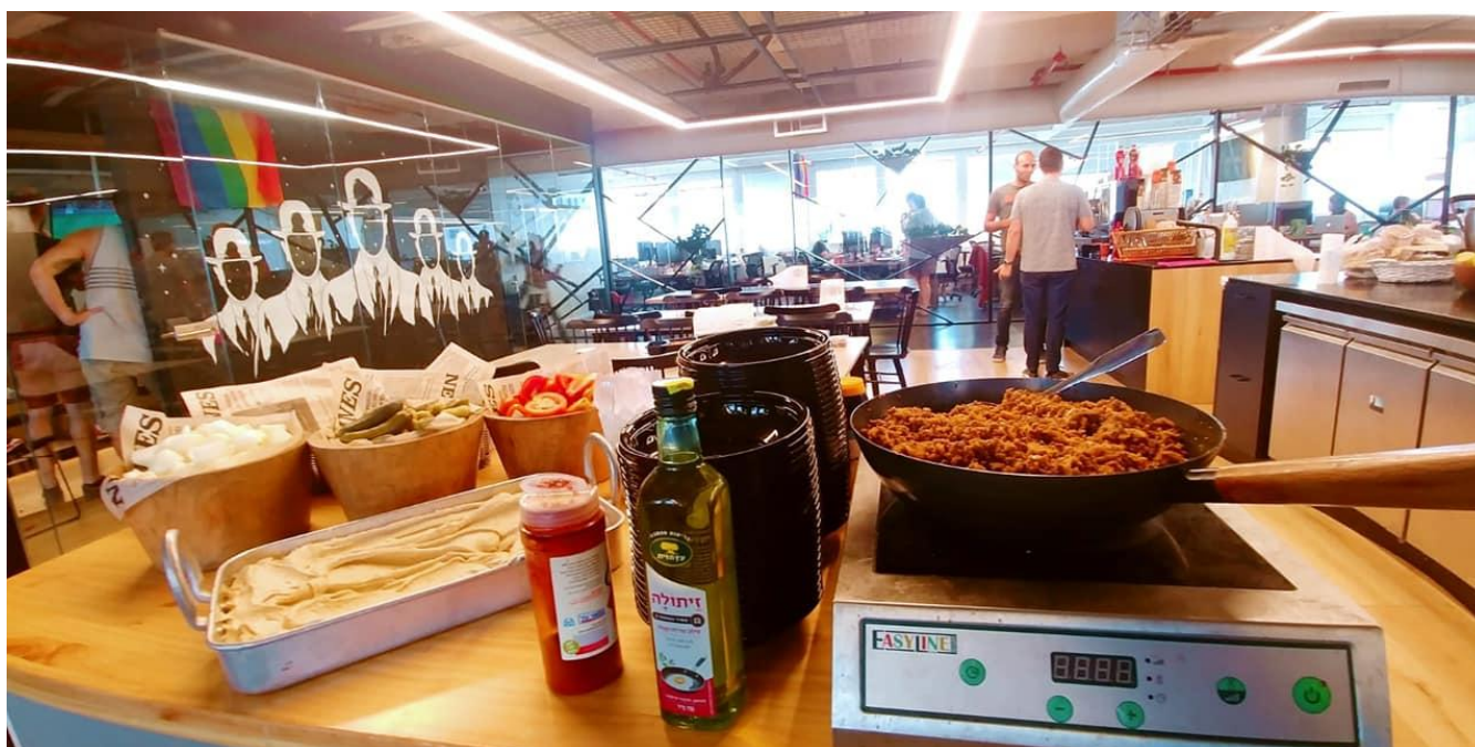
Figure 1: A distinctive mural of five men with empty heads wearing suits and bowler hats is displayed in this “Happy Hour” photo a previous Candiru office posted on Facebook by a catering company. 1

The company known as “Candiru,” based in Tel Aviv, Israel, is a mercenary spyware firm that markets “untraceable” spyware to government customers. Their product offering includes solutions for spying on computers, mobile devices, and cloud accounts.