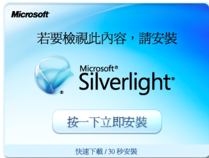
Figure 5. The fake Silverlight download page of the watering hole attack