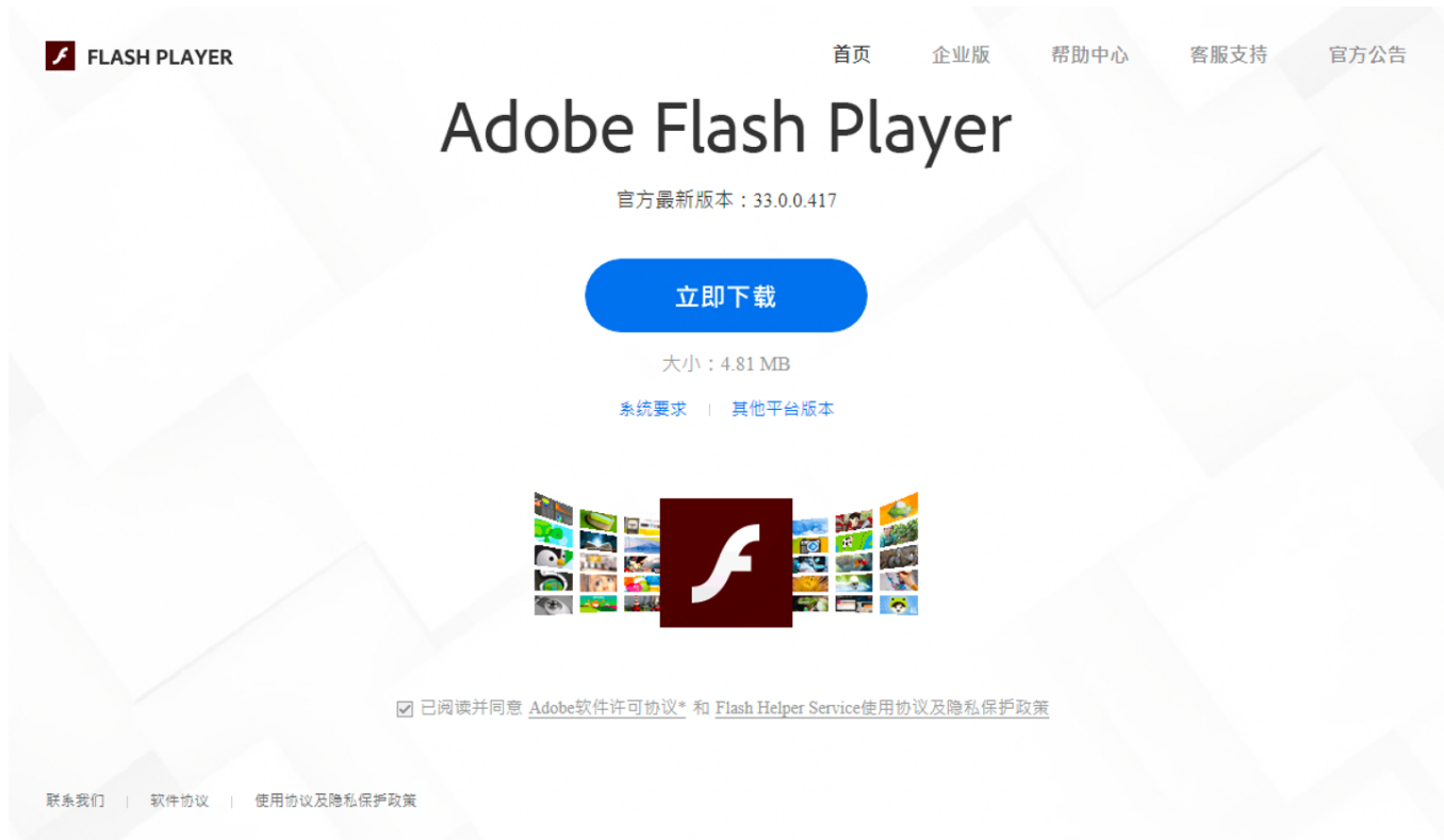
Figure 4. The fake Adobe Flash Player download page of the watering hole attack