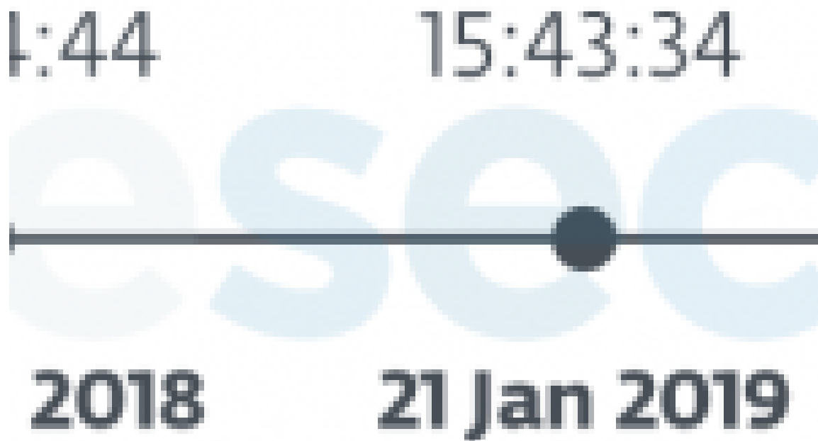
Figure 9. Timeline of known ModPipe variants and their timestamps.

We have found seven different versions of the loader executables, each having a different compilation timestamp, with the oldest one probably originating in December 2017 and the latest in June 2020. For the full timeline, see Figure 9. A list of all the loader hashes is included in the Indicators of Compromise section.