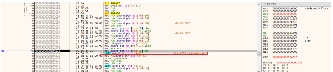
Figure 11: CreateThread

Finally it calls “CreateThread” to create a thread within its memory space to make HTTPS requests to its C&C server.