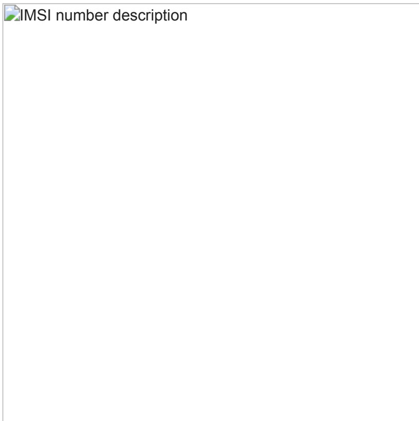
Figure 2: IMSI number description

The Mobile Country Code corresponds to the subscriber's country, the Mobile Network Code corresponds to the specific provider and the Mobile Station Identification Number is uniquely tied to a specific subscriber.