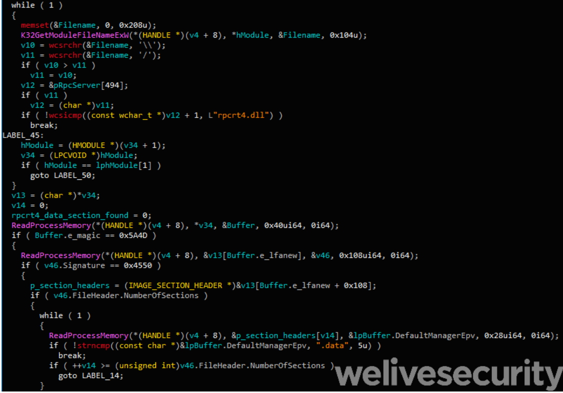
Figure 9. Snippet of code searching for the .data section of rpcrt4.dll in a remote process (Hex-Rays screenshot)

The main purpose of this utility is to retrieve the RPC configuration of a process that has registered an interface. In order to find that kind of process, it iterates through the TCP table (via the GetTcpTable2 function) until it either finds the PID of the process that has opened a specific port, or retrieves the PID of the process that has opened a specific named pipe. Once this PID is found, this utility reads the remote process' memory and tries to retrieve the registered RPC interface. The code for this, seen in Figure 9, seems ripped from this <u>Github repository</u>.