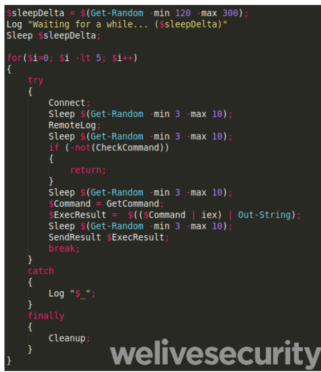
Figure 12. Main loop of the PowerStallion backdoor

Another interesting artefact is that the script modifies the modification, access and creation (MAC) times of the local log file to match the times of a legitimate file – desktop.ini in that example, as shown in Figure 13.