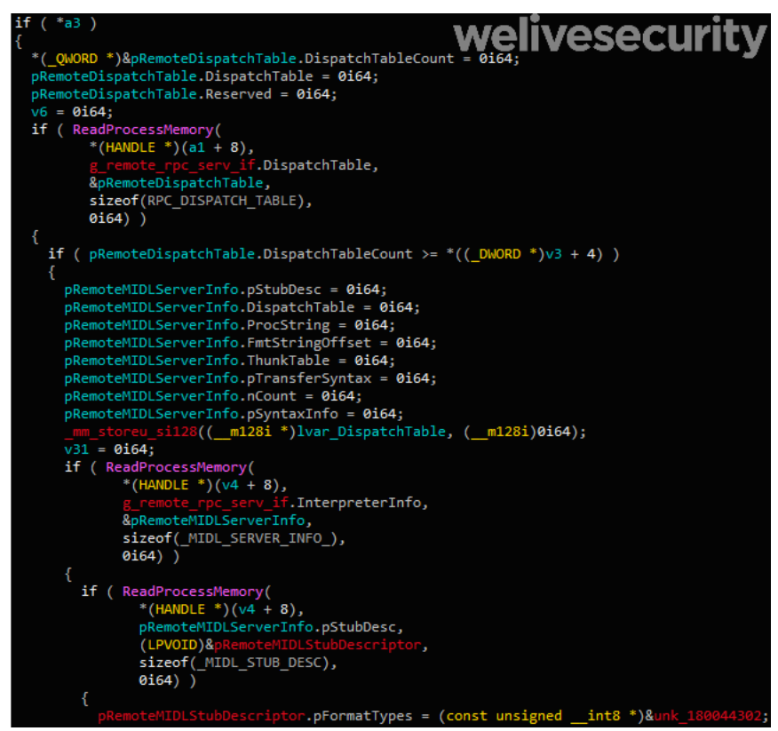
Figure 10. Snippet of code retrieving the RPC dispatch table of the current process (Hex-Rays screenshot)