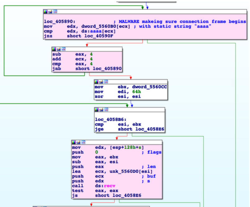
Figure 3 - Screenshot of the malware evaluating a received authentication packet.