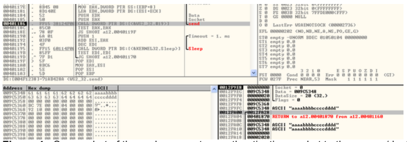
Figure 4 - Screenshot of the malware system authentication packet to the source/destination system.