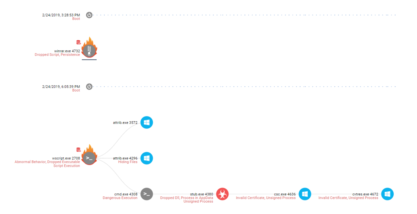
Figure 1: Forensics Report from Sand Blast Agent (in detect only mode to showcase the whole attack) highlighting the script drop and execution upon reboot. (<u>Click here for the full report</u>).

The attack begins by the user extracting an archive using WinRAR believing he is extracting a rbxm file which is a 3D model for Roblox, a popular online gaming platform. In addition to the 3D model, there is a hidden JS file with custom path to user's startup folder as highlighted below.