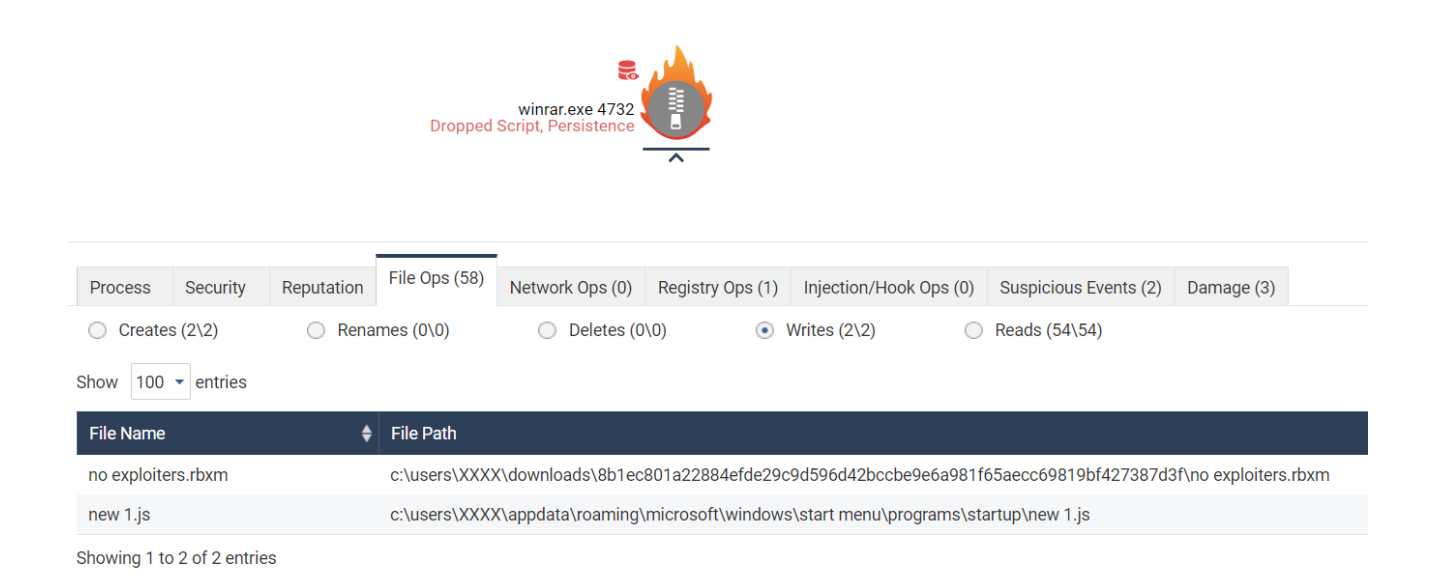
Figure 3: WinRAR process writing JS file to startup folder.

Meanwhile, we can see from the <u>Sand Blast Agent Forensics report</u> that the JS payload file is actually extracted to the user's start-up folder where it will then be launched once the user reboots the machine or simply logs off and logs back on.