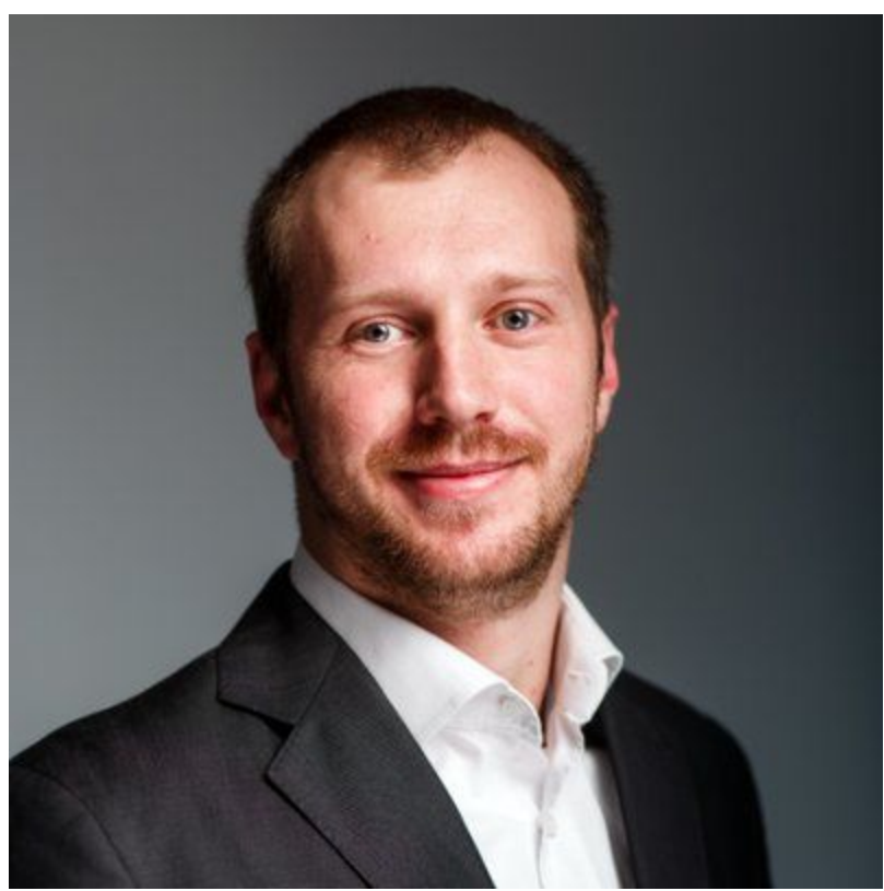
Bogdan BOTEZATU February 19, 2019

B labs.bitdefender.com/2019/02/new-gandcrab-v5-1-decryptor-available-now/