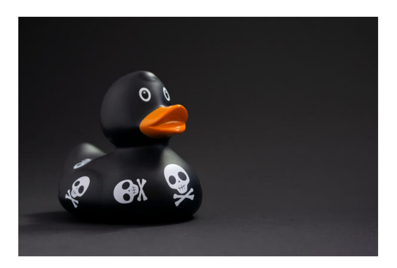
Subscribe to the ThreatSTOP blog