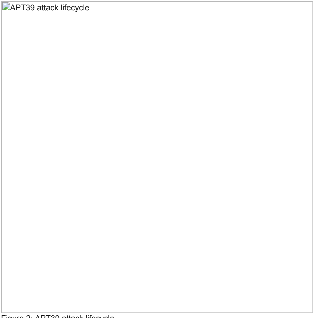
Figure 2: APT39 attack lifecycle

There are some indications that APT39 demonstrated a penchant for operational security to bypass detection efforts by network defenders, including the use of a modified version of Mimikatz that was repacked to thwart anti-virus detection in one case, as well as another instance when after gaining initial access APT39 performed credential harvesting outside of a compromised entity's environment to avoid detection.