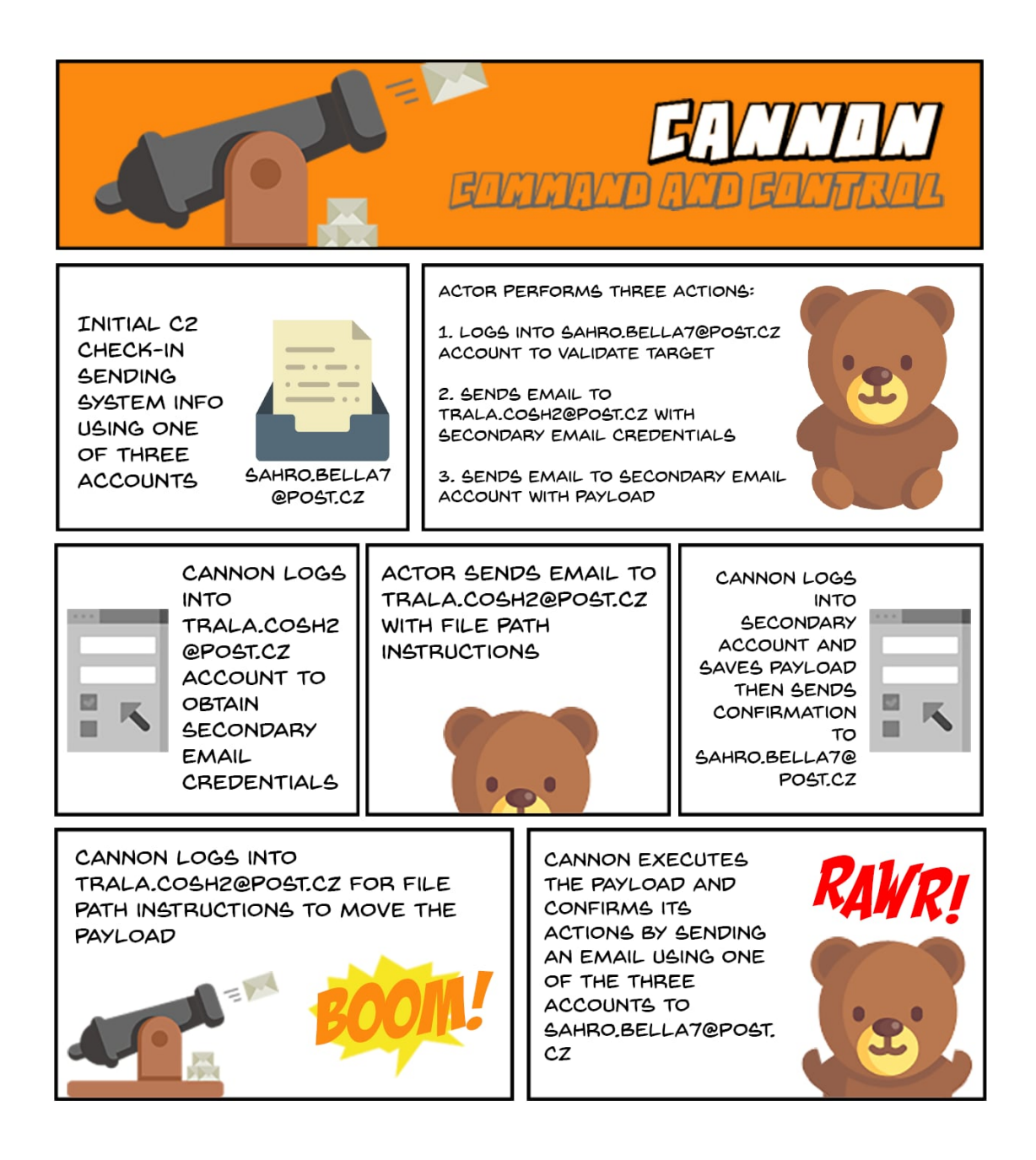
Figure 2 C2 process flow for Cannon