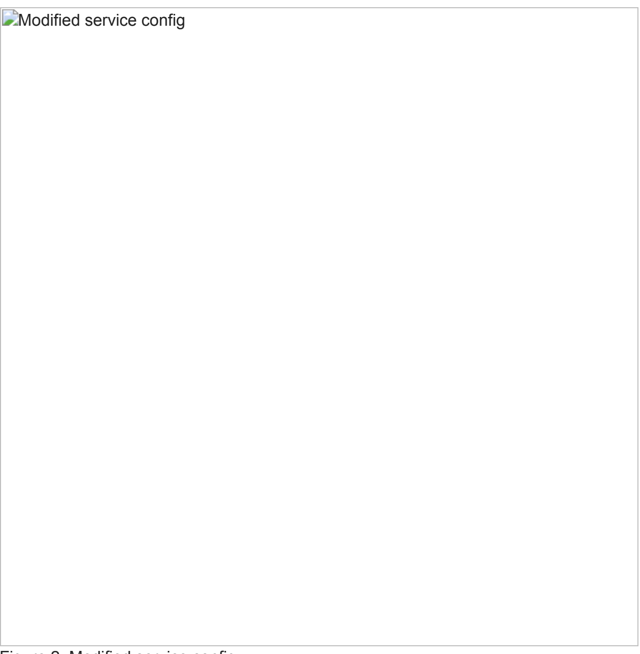
Figure 2: Modified service config

We identified file creation times for numerous files that TEMP. Veles created during lateral movement on a target's network. These file creation times conform to a work schedule typical of an actor operating within a UTC+3 time zone (Figure 1) supporting a proximity to Moscow.