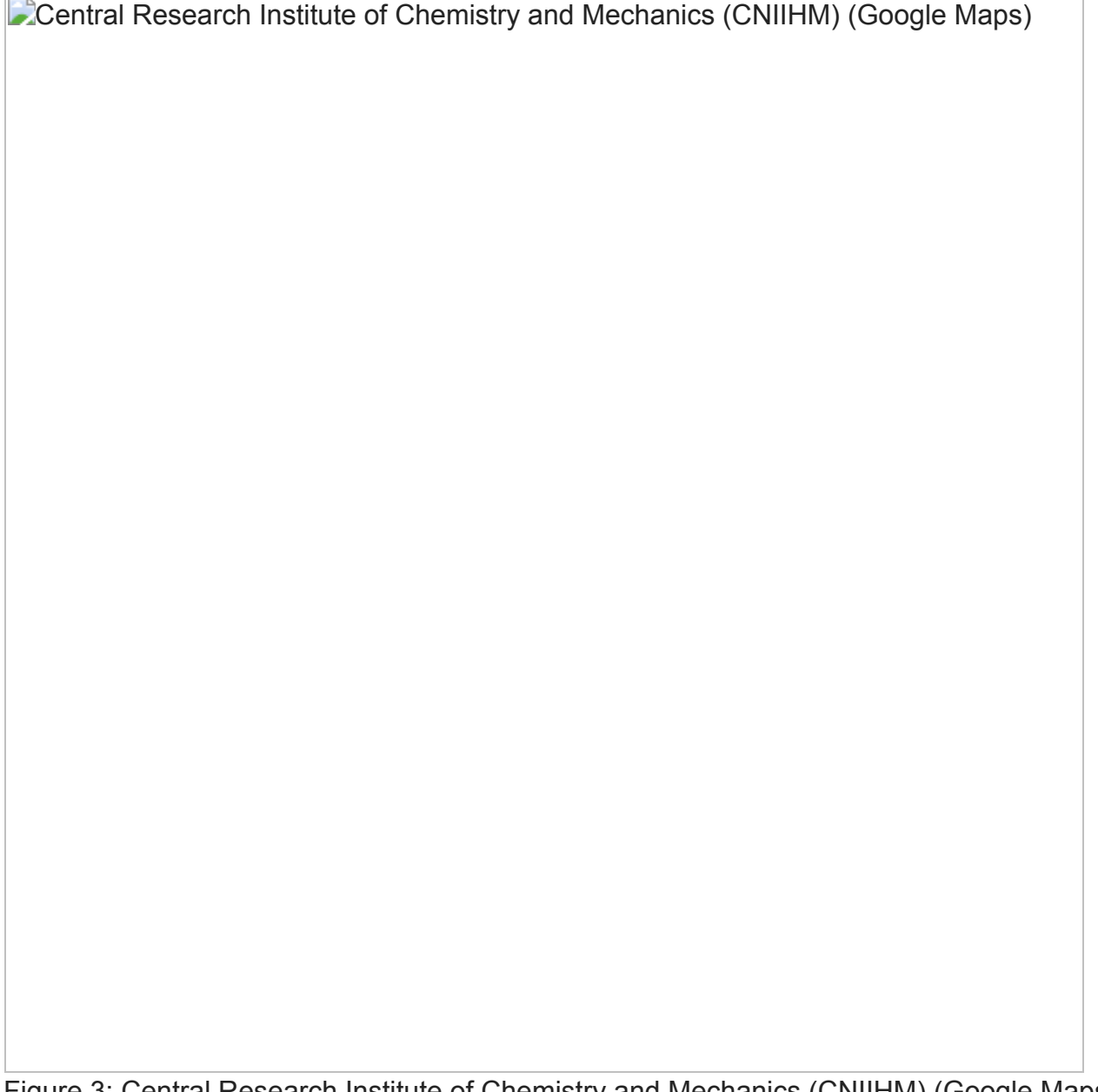
Figure 3: Central Research Institute of Chemistry and Mechanics (CNIIHM) (Google Maps) CNIIHM Likely Possesses Necessary Institutional Knowledge and Personnel to Create TRITON and Support TEMP. Veles Operations