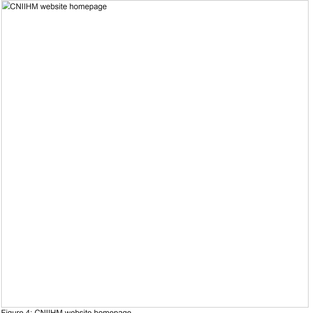
Figure 4: CNIIHM website homepage