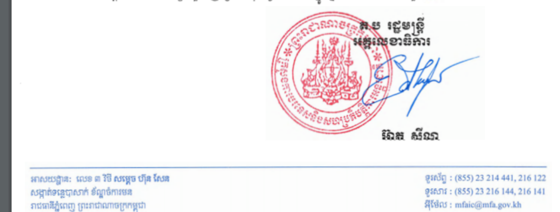
Figure 1 Decoy document for b8120d5c9c2c889b37aa9e37514a3b4964c6e41296be216b327cdccd2e908311

អាស្រ័យដូចបានជម្រាបជូនខាងលើ សូម ឯកឧត្តម លោកជំទាវ លោក លោកស្រី មេត្តា ផ្តល់ព័ត៌មានមកក្រសួងវិញឱ្យបានមុនថ្ងៃទី១៥ ខែធ្នូ ឆ្នាំ២០១៧ តាមការគួរ រ<del>ទ</del>