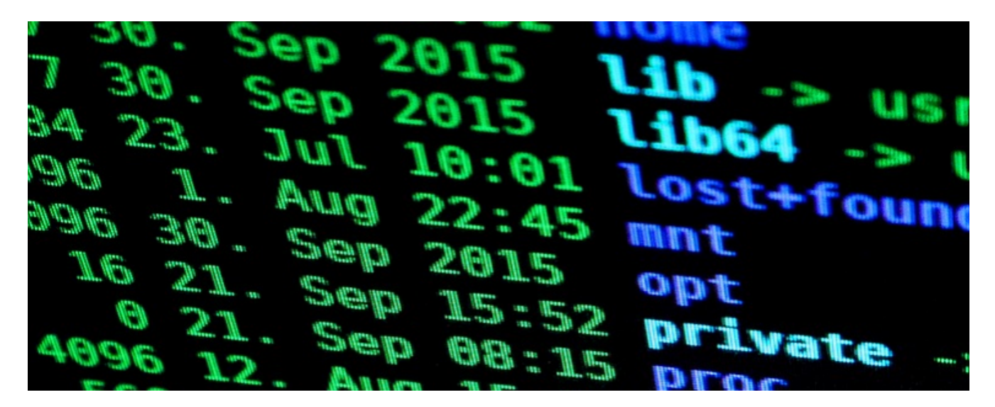
August 23, 2018 Proofpoint Staff