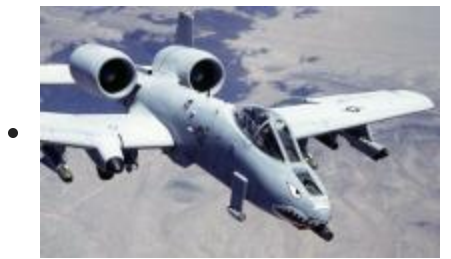
Warthog-Fan - 3 years ago

Of course the main stream media never reported it and will continue to not report it.