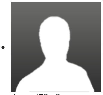
dogood76 - 3 years ago

Everyone blames the Russians for hacking the DNC during the 2016 presidential election. However, since the DNC never allowed any security agency to inspect their servers, there is no actual PROOF that the Russians had anything to do with the release of the Clinton and Podesta emails, and it is just as likely that the emails were leaked by a person working for the Clinton campaign.