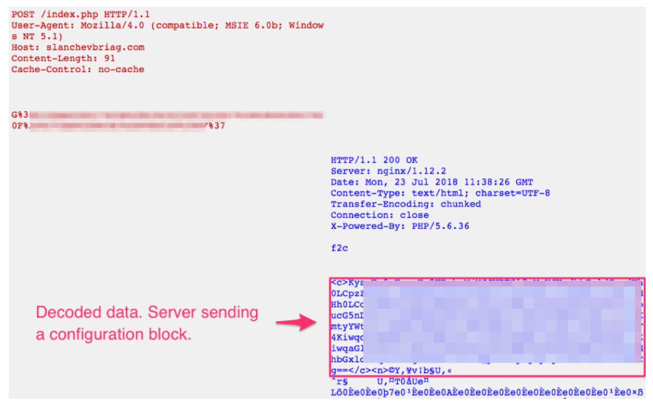
Figure 4: Initial client beacon followed by the server response (decoded by us manually)

As Figure 4 shows, there is a base64 string (configuration block) included in the server response between the "<c>" and "</c>" tags. It decodes to the following, revealing cryptocurrency strings of interest: