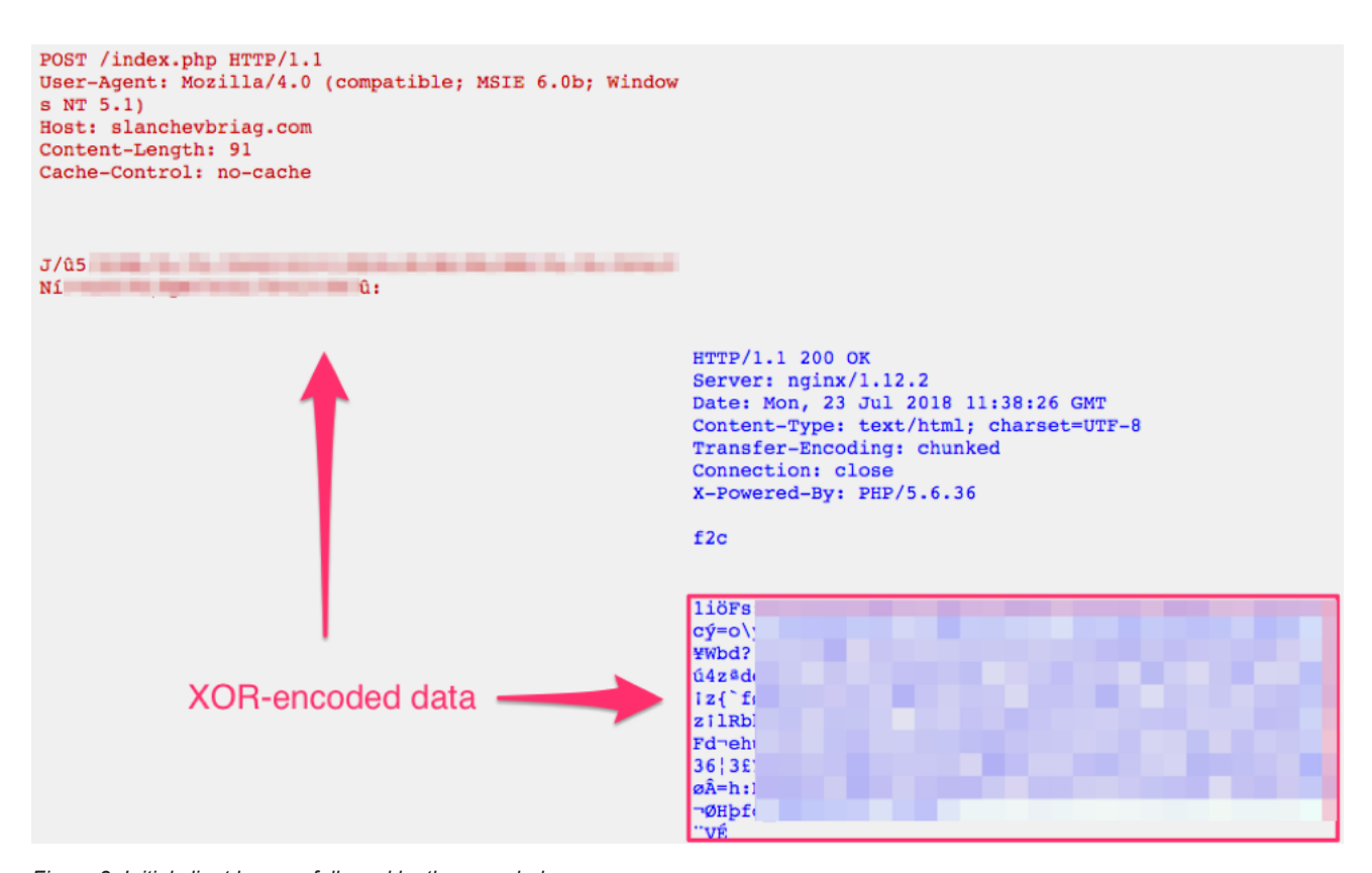
Figure 3: Initial client beacon followed by the encoded server response