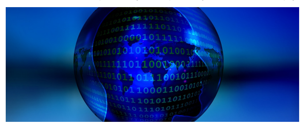
July 30, 2018 Proofpoint Staff