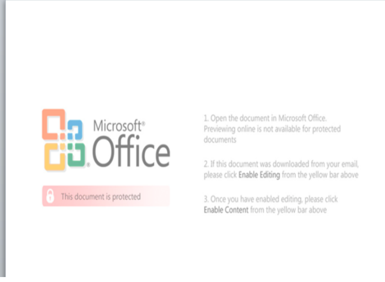
Figure 2. Lure image used to entice users to enable macros