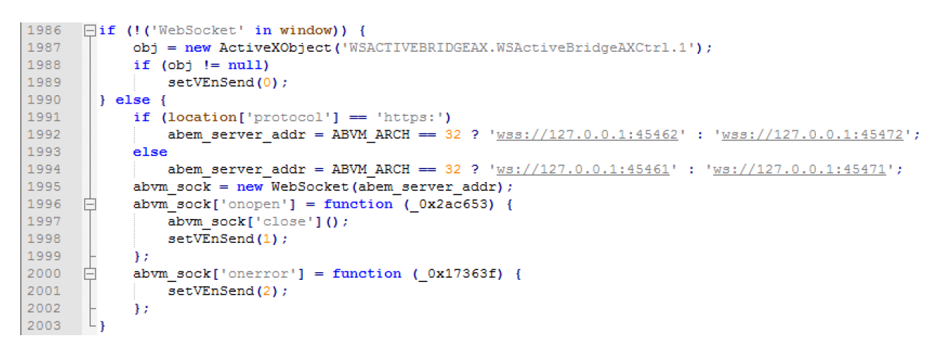
Figure 3. Script (Deobfuscated) for detecting the voice conversion software ActiveX object and local websocket availability

In addition, the verification process in the older script is different from the ActiveX detection, which was only for the Internet Explorer browser. In the script found in June, the websocket verification could also be performed on other browsers like Chrome and Firefox. This shows that the attacker has expanded his target base, and is interested in the software itself and not just their ActiveX objects. Based on this change, we can expect them to start using attack vectors other than ActiveX.