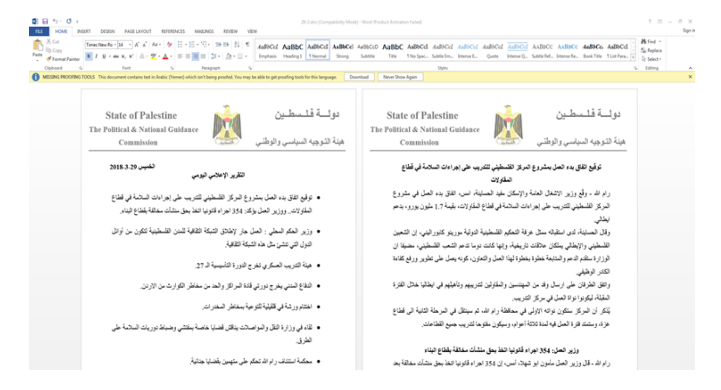
Figure 1: Screenshot of Word Document.

Although the archive was found on mid-April, the Word document shows that it was last edited on March 29<sup>th</sup>, 2018. This date is also mentioned in the document's body and used as its title, "29-3.doc". The metadata in the document shows that it was also titled "مايادة العقيد /عصام", which happens to be the name of the Guidance Commission Office's Chief Executive: