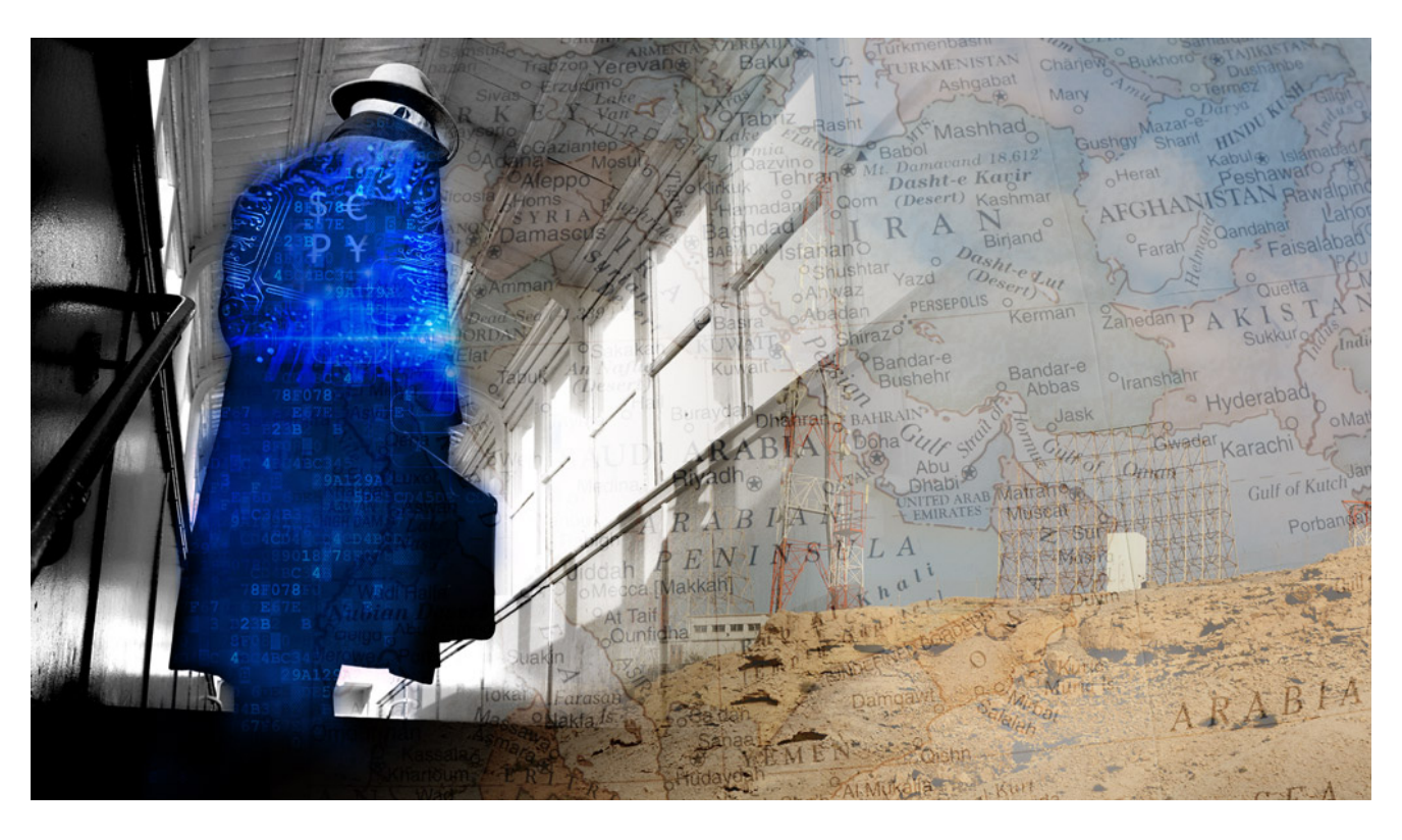
July 8, 2018

Over the last few weeks, the Check Point Threat Intelligence Team discovered the comeback of an APT surveillance attack against institutions across the Middle East, specifically the Palestinian Authority.