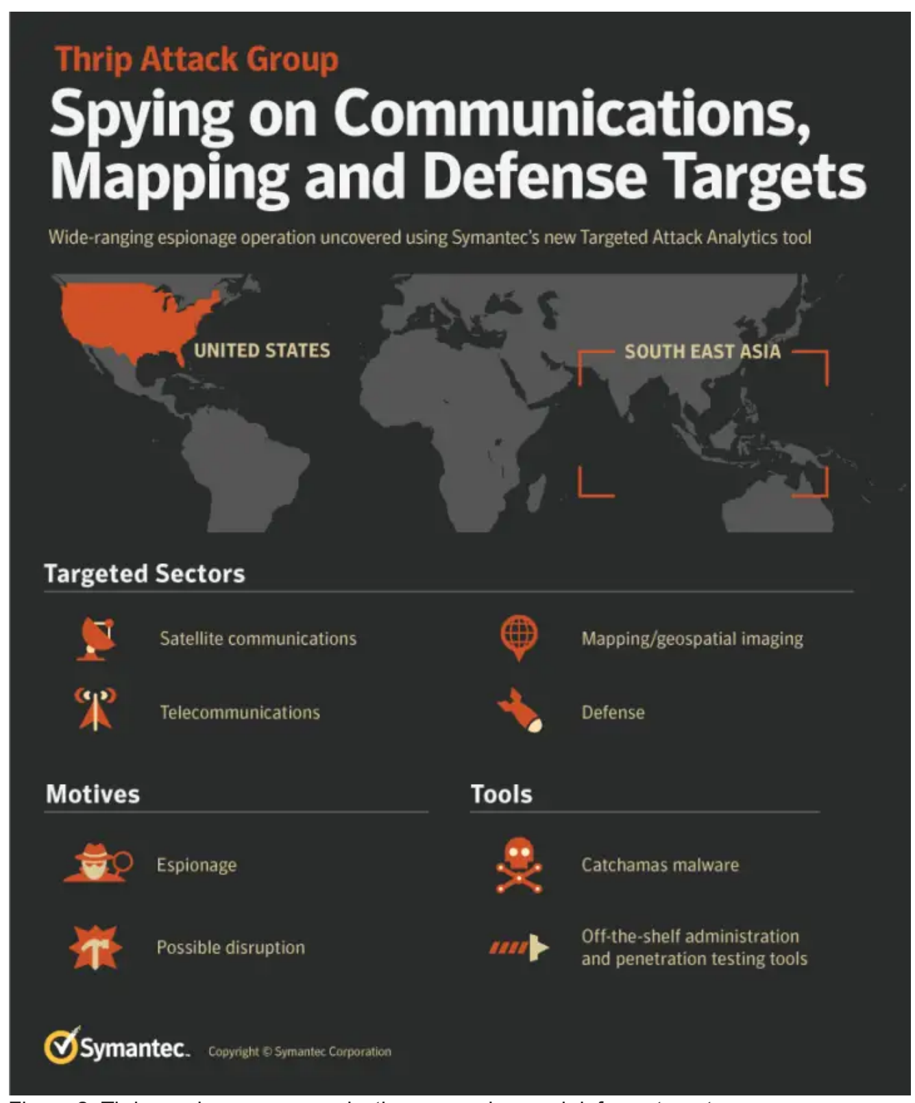
Figure 2. Thrip, spying on communications, mapping, and defense targets