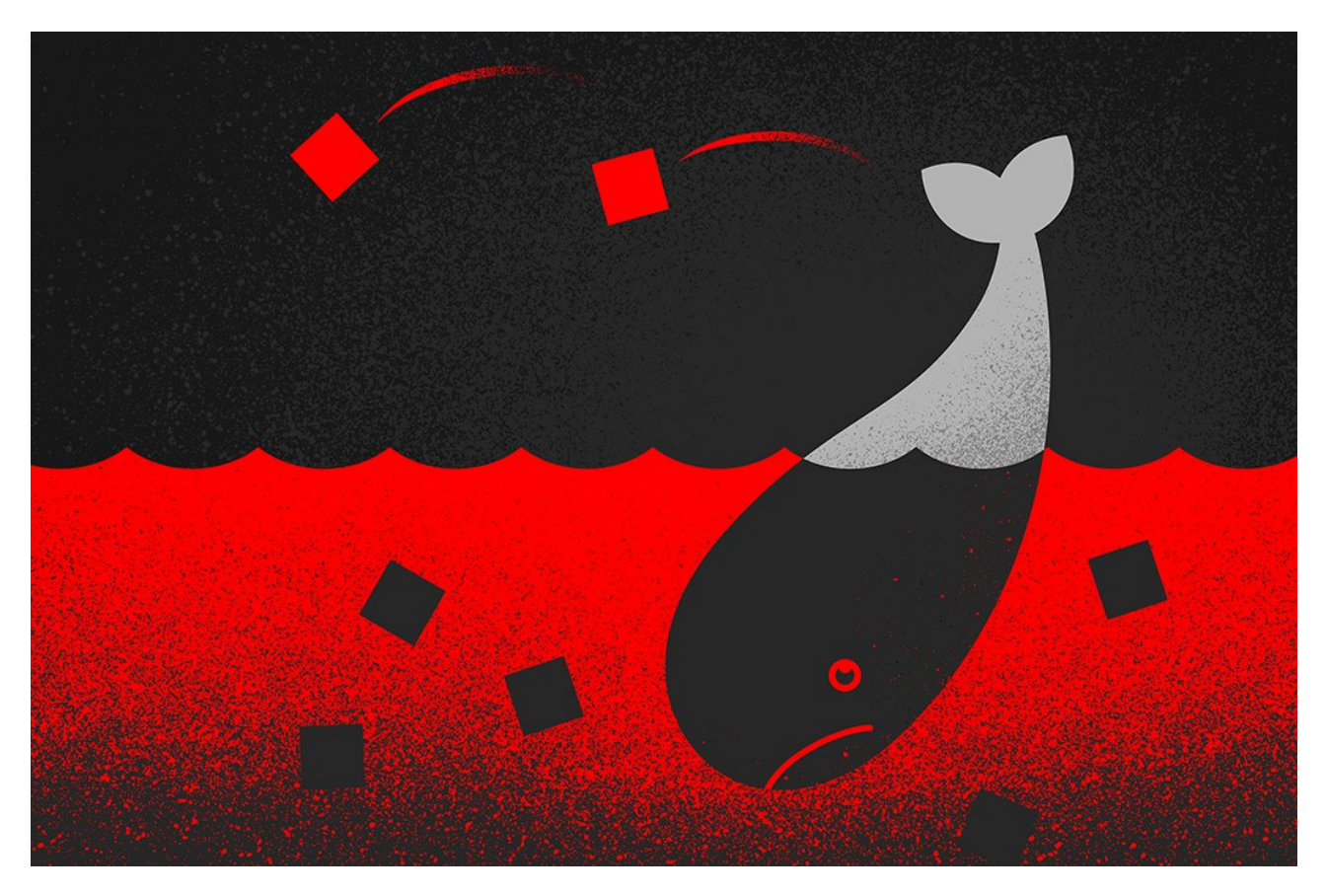
Compromised Docker Honeypots Used for Pro-Ukrainian DoS Attack