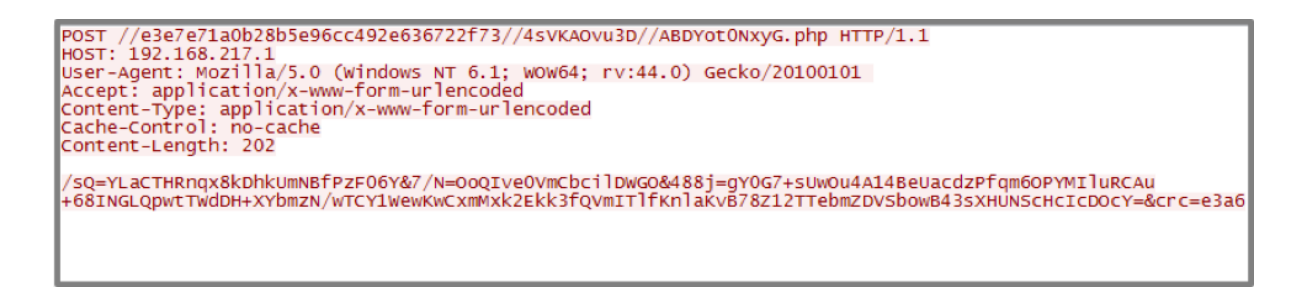
Figure 8 Example request made by BADNEWS

When initial pings are sent to the remote server, BADNEWS includes one of the two previously created strings containing the victim's information. An example request in a sandboxed environment may be seen below: