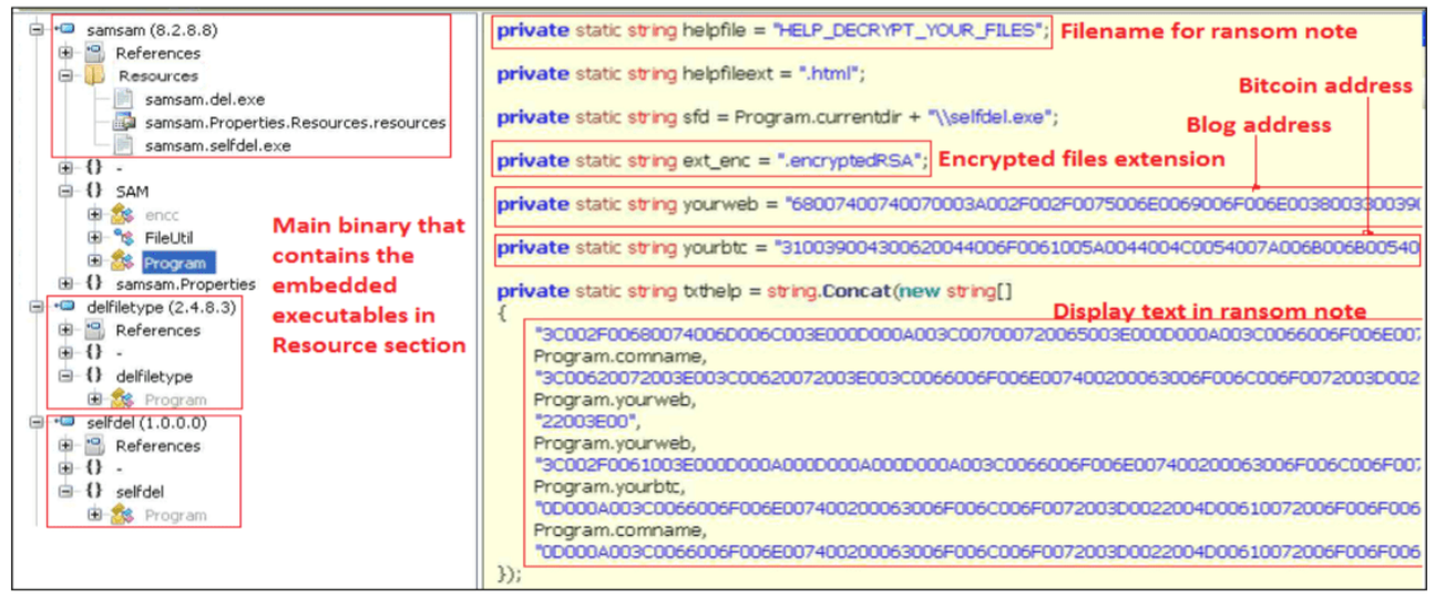
Figure 3. SamSam ransomware binary.

SamSam — This custom ransomware .NET binary originally contained two embedded executables: del.exe or delfiletype.exe (SDelete Sysinternals program) and selfdel.exe (used to delete its malicious activity) (see Figure 3). A variant from mid-2016 included a single SDelete binary hidden in the resource section and created a Windows batch script to perform some of the 'self-delete' functionality previously provided by selfdel.exe. Samples from <u>October 2017</u> that used the .stubbin extension included additional changes such as use of a .NET loader to decrypt and execute the payload.