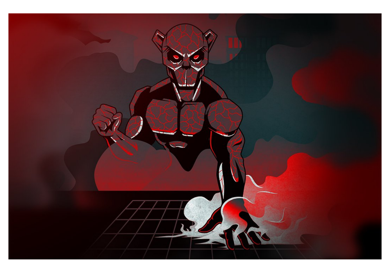
Who is EMBER BEAR?