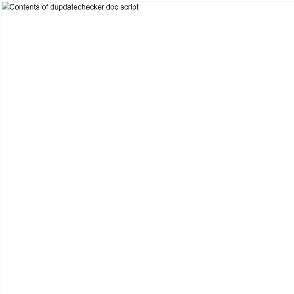
Figure 12: Contents of dupatechecker.doc script

As shown in Figure 12, the script within the dupatechecker.doc file attempts to download another file named dupatechecker.exe from the same server. The file also contains a comment by the malware author that appears to be an apparent taunt to security researchers.