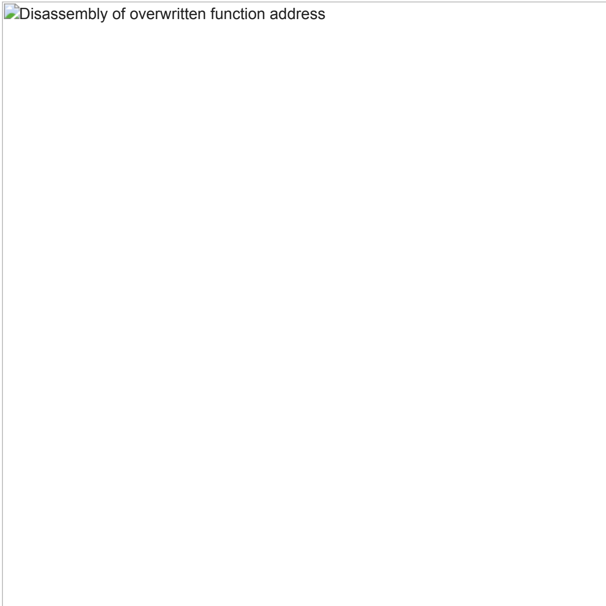
Figure 1: Disassembly of overwritten function address

After exploitation, the 'WinExec' function is successfully called to create a child process, "mshta.exe", in the context of current logged on user. The process "mshta.exe" downloads a malicious script from http://mumbai-m[.]site/b.txt and executes it, as seen in Figure 2.