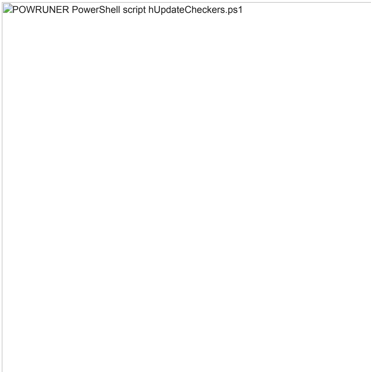
Figure 5: POWRUNER PowerShell script hUpdateCheckers.ps1

The backdoor component, POWRUNER, is a PowerShell script that sends and receives commands to and from the C2 server. POWRUNER is executed every minute by the Task Scheduler. Figure 5 contains an excerpt of the POWRUNER backdoor.