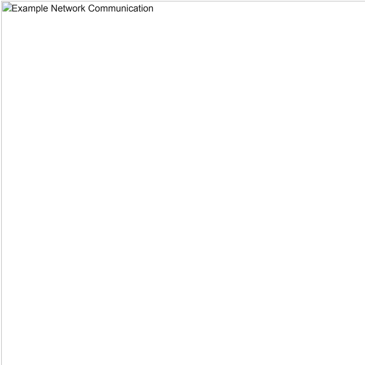
Figure 9: Example Network Communication

In the example, the POWRUNER client sends a random GET request to the C2 server and the C2 server sends the random number (99999999990) as a response. As the response is a random number that ends with '0', POWRUNER sends another random GET request to receive an additional command string. The C2 server sends back Base64 encoded response.