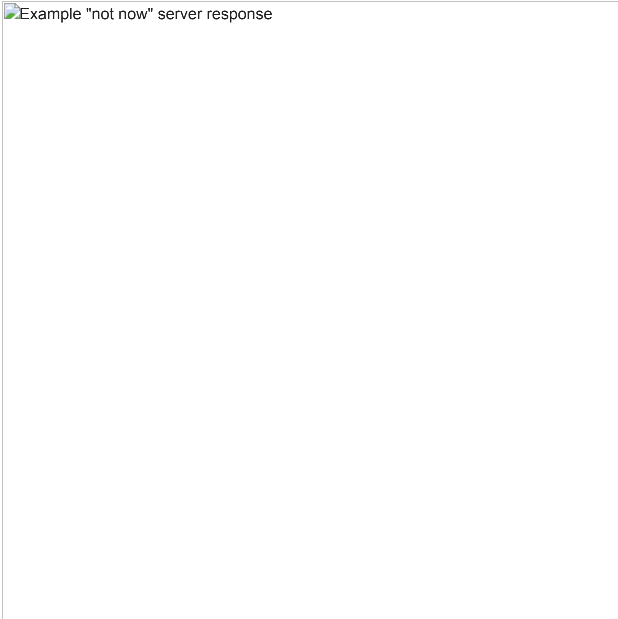
Figure 10: Example "not now" server response