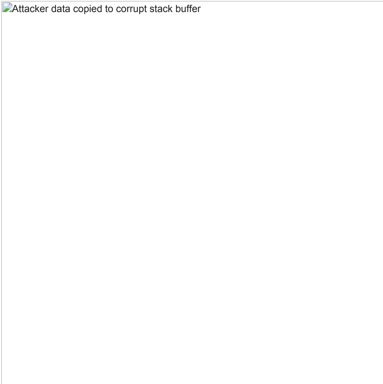
Figure 2: Attacker data copied to corrupt stack buffer