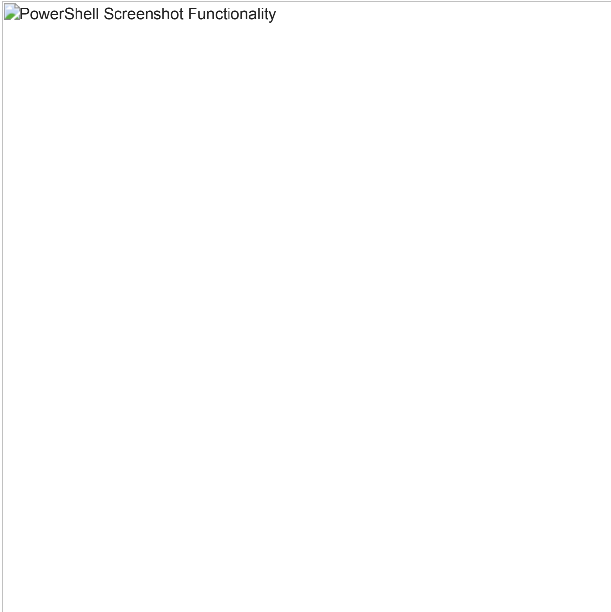
Figure 6: PowerShell Screenshot Functionality