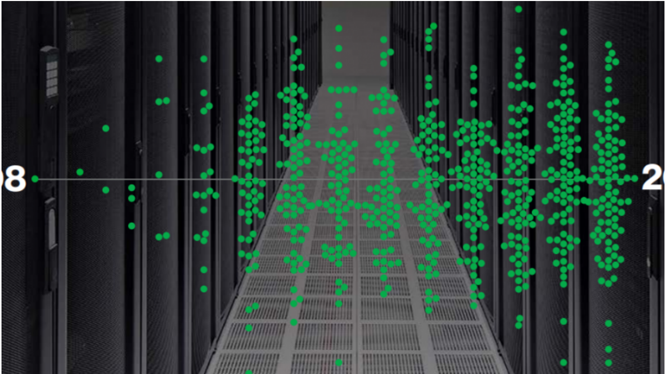
The Verizon 2022 DBIR