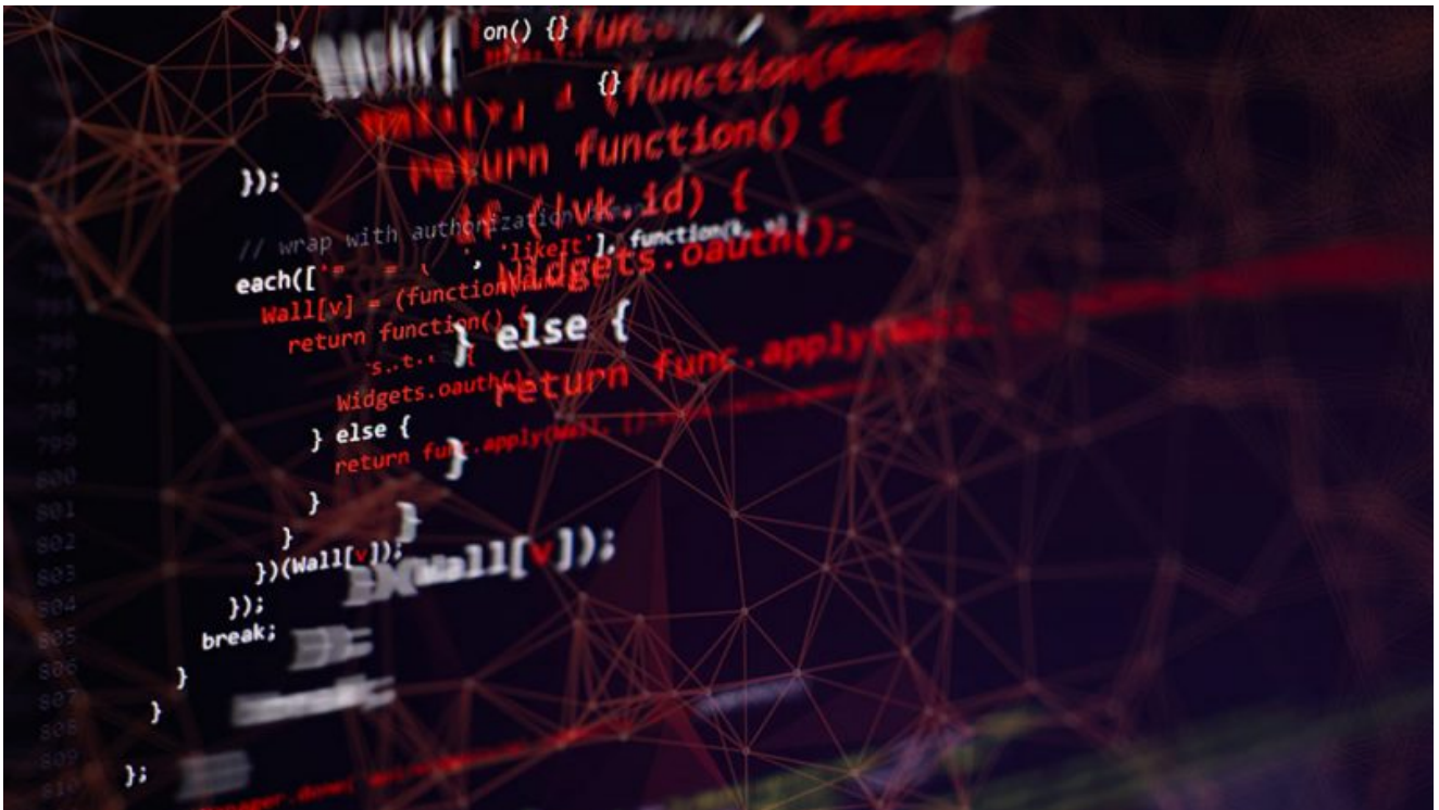
Evaluation of cyber activities and the threat landscape in Ukraine