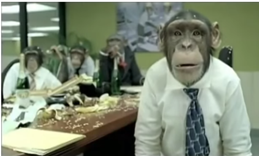
Figure 1. Cozyduke campaign used an “Office Monkeys” video as a lure—July 2014

The group began its current campaign as early as March 2014, when Trojan.Cozer (aka Cozyduke) was identified on the network of a private research institute in Washington, D.C. In the months that followed, the Duke group began to target victims with “Office Monkeys”- and “eFax”-themed emails, booby-trapped with a Cozyduke payload. These tactics were atypical of a cyberespionage group. It’s quite likely these themes were deliberately chosen to act as a smokescreen, hiding the true intent of the adversary.