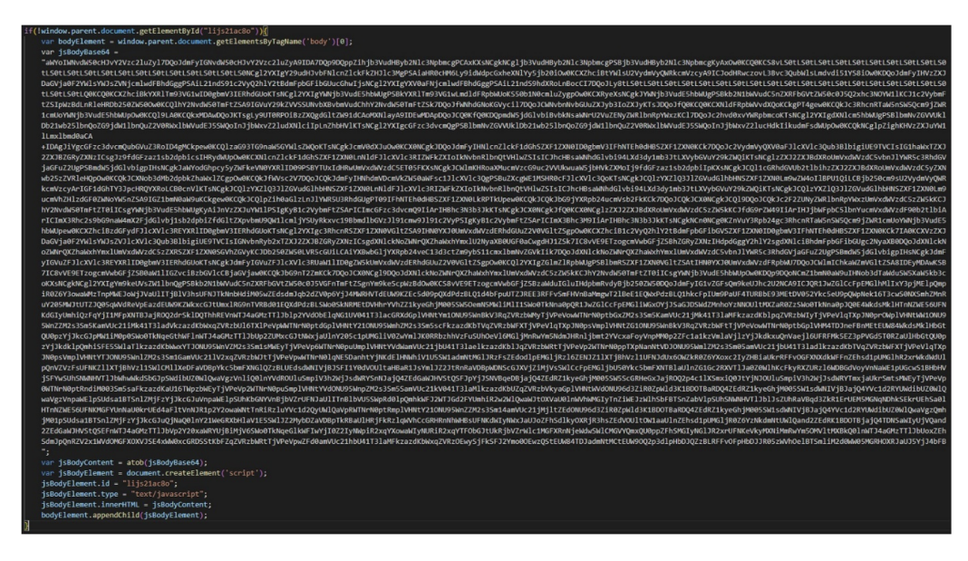
Figure 4. Base64 encoded CSRF JavaScript payload (excerpted for length).

Proofpoint researchers have identified several instances of what appear to be customized CSRF JavaScript payloads with delivery achieved through both the above-mentioned CVE-2022-27926 exploitation and earlier delivery mechanisms, such as TA473-controlled infrastructure delivery stemming from the hyperlink of benign URLs in the body of the phishing email. These CSRF JavaScript code blocks are executed by the server that host a vulnerable webmail instance. Further, this JavaScript replicates and relies on emulating the JavaScript of the native webmail portal to return key web request details that indicate the username, password, and CSRF token of targets. In some instances, researchers observed TA473 specifically targeting RoundCube webmail request tokens as well. This detailed focus on which webmail portal is being run by targeted European government entities indicates the level of reconnaissance that TA473 conducts prior to delivering phishing emails to organizations. These next-stage TA473 CSRF JavaScript payloads also utilize several layers of Base64 encoding to obfuscate the functionality of the JavaScript. The actor inserts three nested instances of Base64 encoded JavaScript to complicate analysis of these delivered payloads. However, decoding the script is trivial to reveal the intended malicious functionality.