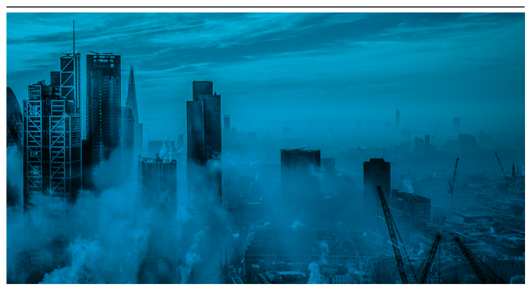
Exploitation is a Dish Best Served Cold: Winter Vivern Uses Known Zimbra Vulnerability to Target Webmail Portals of NATO-Aligned Governments in Europe