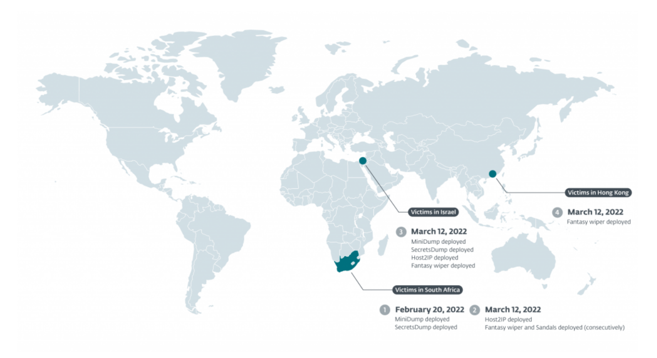
Figure 1. Victim timeline and locations

The campaign lasted less than three hours and within that timeframe ESET customers were already protected with detections identifying Fantasy as a wiper, and blocking its execution. We observed the software developer pushing out clean updates within a matter of hours of the attack. We reached out to the software developer to notify them about a potential compromise, but our enquiries went unanswered.