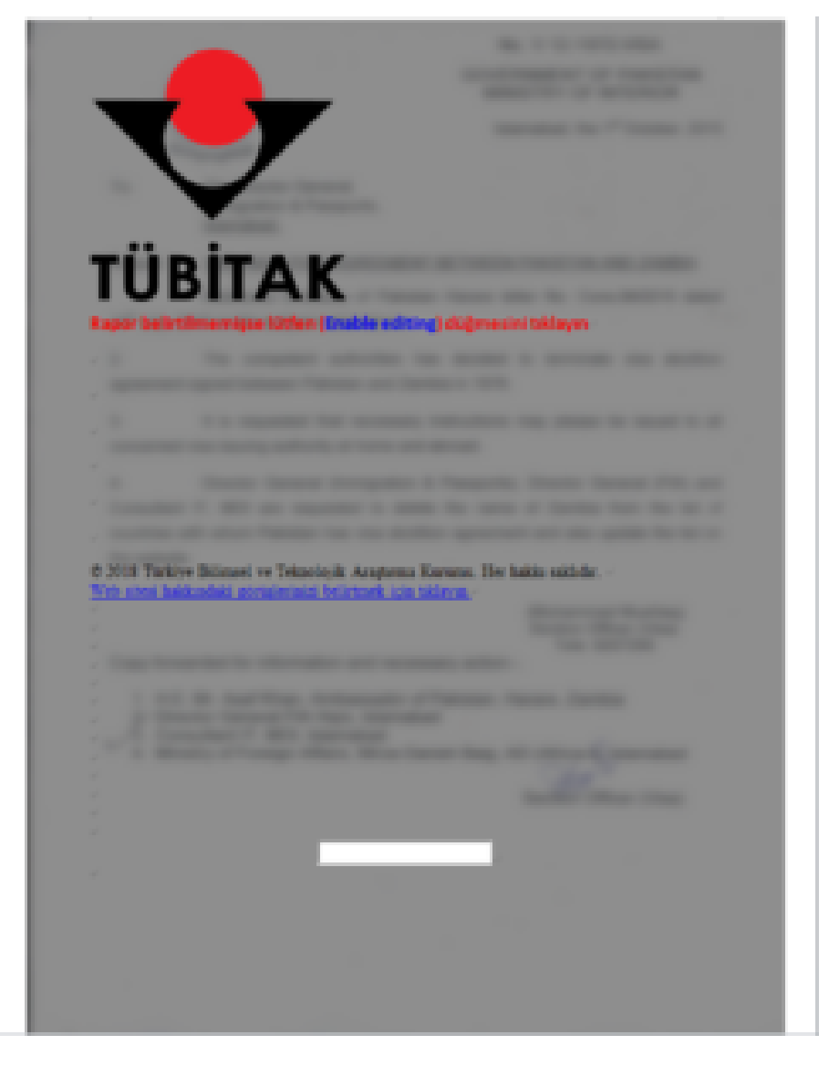
Phishing Document B for Turkish Academy of Science and Technology

After discovering this clue, Fuying Lab launched an investigation into the possible relationship between Muren Shark and MuddyWater.