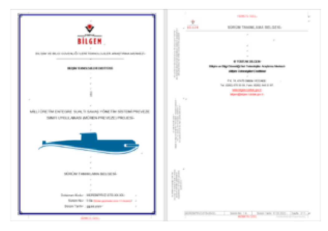
Phishing Document B

This phishing document corresponds to a description file for a software system called "MÜREN-PREVEZE ".