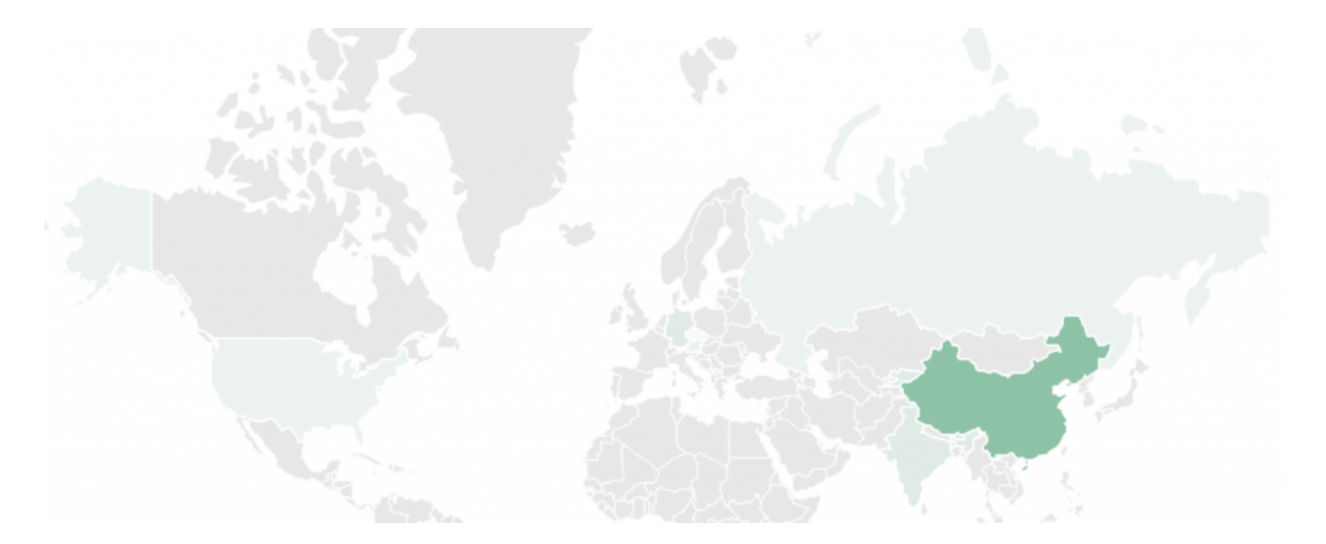
Geographic distribution of WinDealer targets

In recent months, LuoYu has started to widen its scope to companies and users in East Asia and their branches located in China.