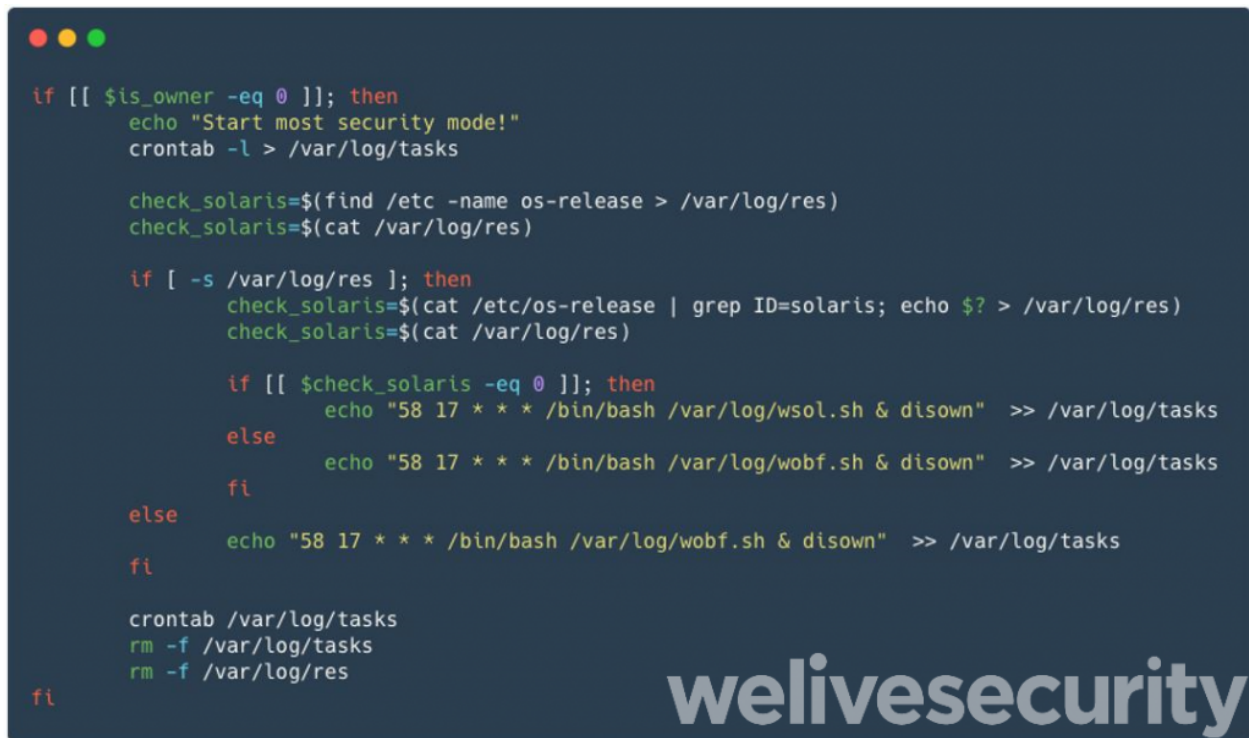
Figure 9. Setting up the cron job to launch the wiper at 5:58pm. The correct wiper is picked depending on the installed operating system.

The script then iterates over the networks accessible by the system by looking at the result of ip route or ifconfig -a . It always assumes a class C network (/24) is reachable for each IP address it collects. It will try to connect to all hosts in those networks using SSH to TCP port 22, 2468, 24687 and 522. Once it finds a reachable SSH server, it tries credentials from a list provided with the malicious script. We believe the attacker had credentials prior to the attack to enable the spread of the wiper.