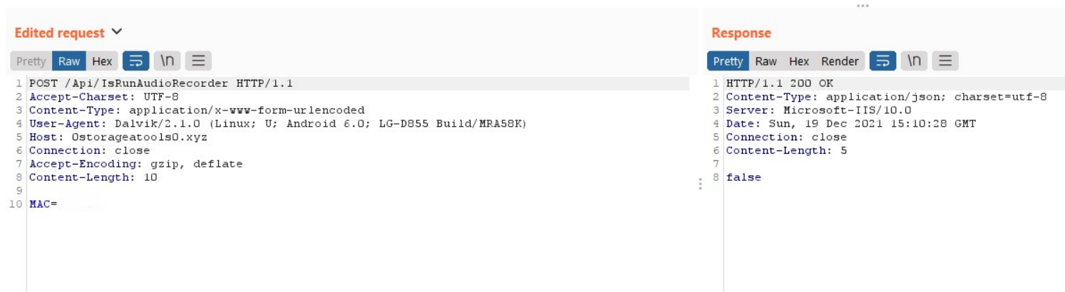
Figure 5: The PowerShell variant C&C response to the /Api/IsRunAudioRecorder API endpoint.

The rest of the API endpoints responded with a 405 HTTP error, which is a different response from a non-existent URL ( /Api/RANDOM_STRING always responds with 404 HTTP error).