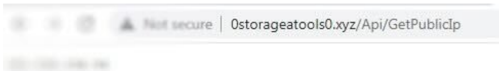
Figure 4: The C&C from the PowerShell sample responds to the /Api/GetPublicIp API request.

Even more interesting, additional tests showed that not only are the URLs similar, but the C&C domain of the PowerShell variant actually responds to the API requests that are used in the mobile variant.